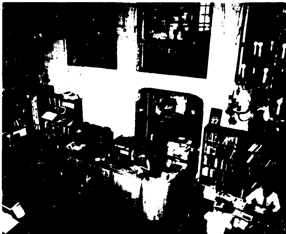
The circulation control desk and current periodicals reading room, National Science Library.

in brief: The National Science Library in Ottawa has developed services which ensure that the scientific and industrial communities of Canada can have ready access to the world's output of scientific and technical literature. The Library's services, many of them free, are available to any individual scientist or engineer who can define his problem and make his needs known. The needed information can be provided, thanks to the Library's unmatched resources and organization, with a minimum of delay.