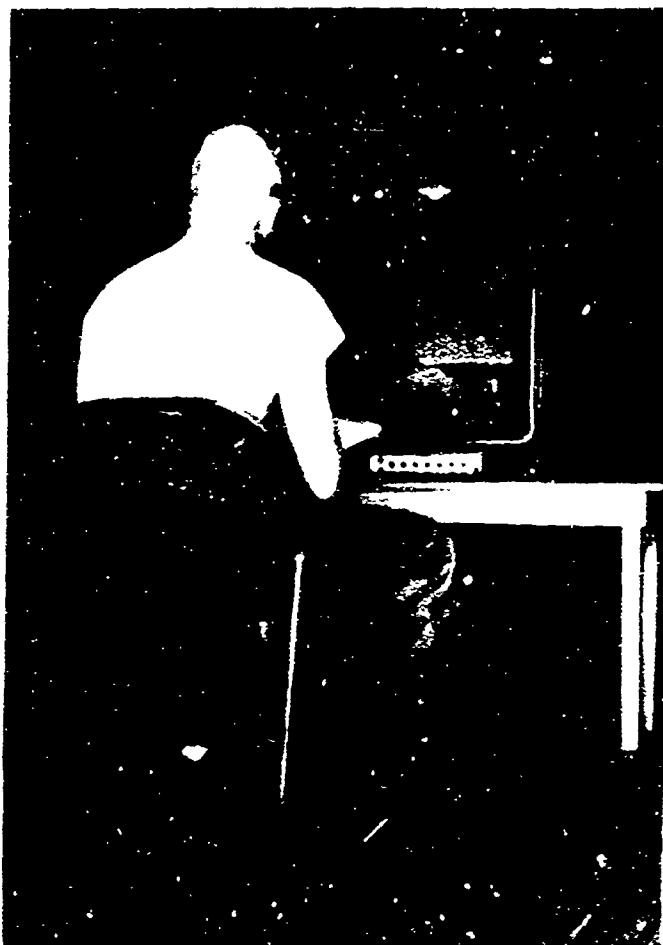
Fig. 1. SUBJECT VIEWING TV PRESENTATION OF THE TARGET

The equipment for the TV presentation consisted of a General Precision Laboratories P.D.-152 closed-circuit TV system. A 21-inch TV monitor was placed in the front of a semitrailer van (Fig. 1). The TV camera was placed at one end of a level 1200-yard road. A shutter was placed over the camera lens to conceal the target's movement while it was being positioned.