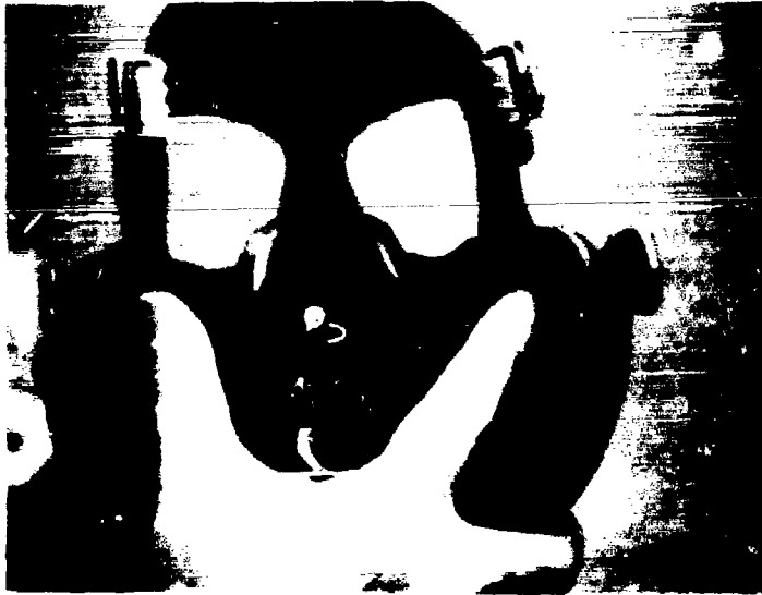
Figure 3 - First Developmental Model Water Intake Equipment Installed In Protective Mask