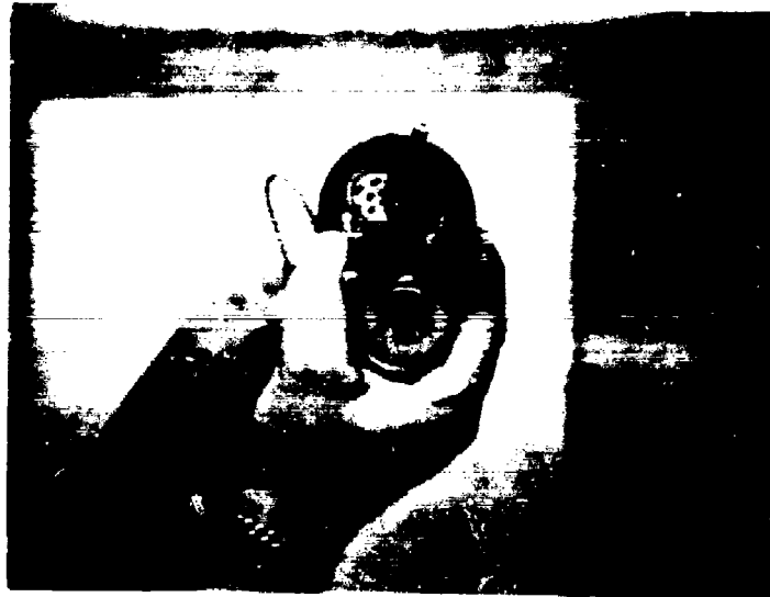
Figure 1 - First Developmental Model Water Intake Equipment In Extended Position