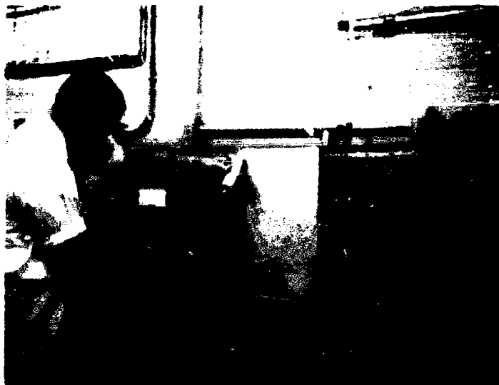
Figure 4 - General View of Leakage Testing Equipment Showing Detector (Left) and Testing Chamber (Right)