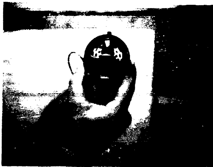
Figure 2 - First Developmental Model Water Intake Equipment In Retracted Position