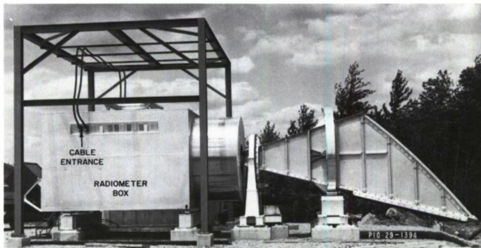
Fig. 76-2. Radiometer box and cornucopia assembly, antenna in stowed position.