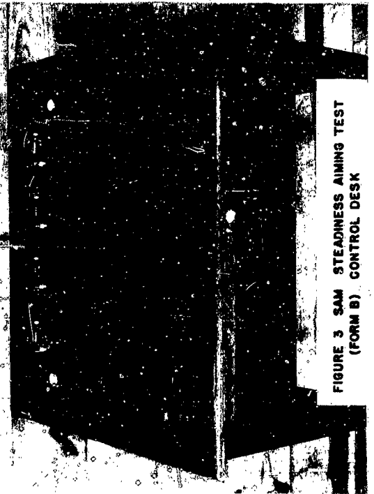
FIGURE 3 SAM STEADINESS AIMING TEST (FORM B) CONTROL DESK