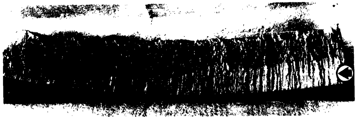
Fig. 1 - Macroscopic view of a section from the fracture in the landing gear forging showing the initiation region, light area (arrow), and the fast crack propagation region, dark area. Magnification 5.5X.