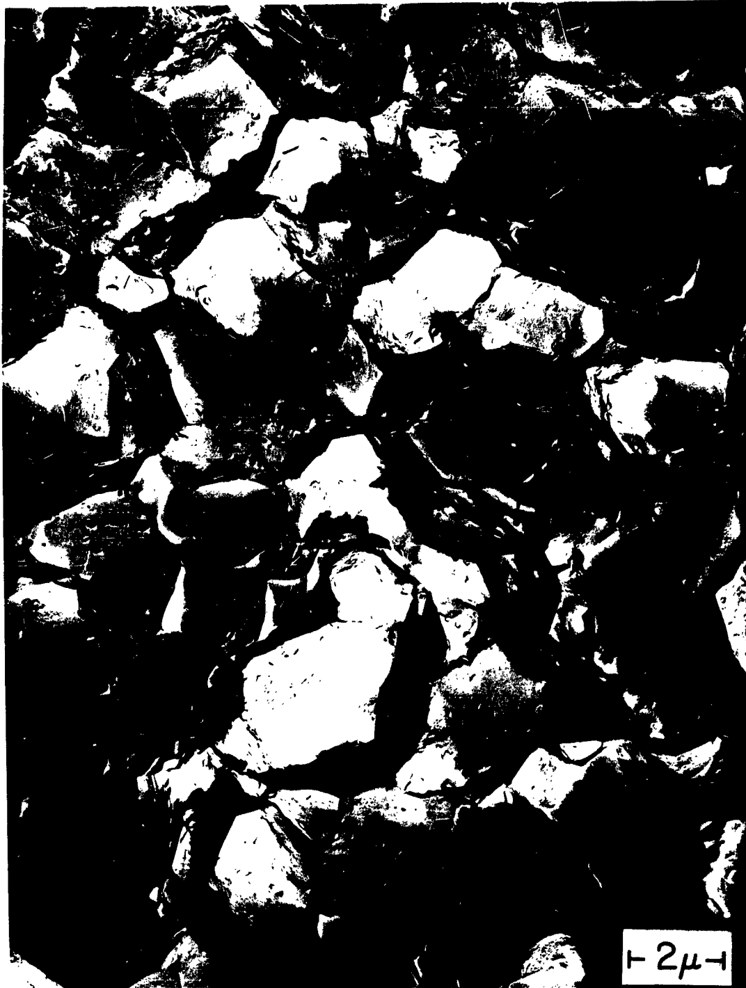
Fig. 2 - Intergranular fracture in the crack initiation region. Magnification 6,000X.