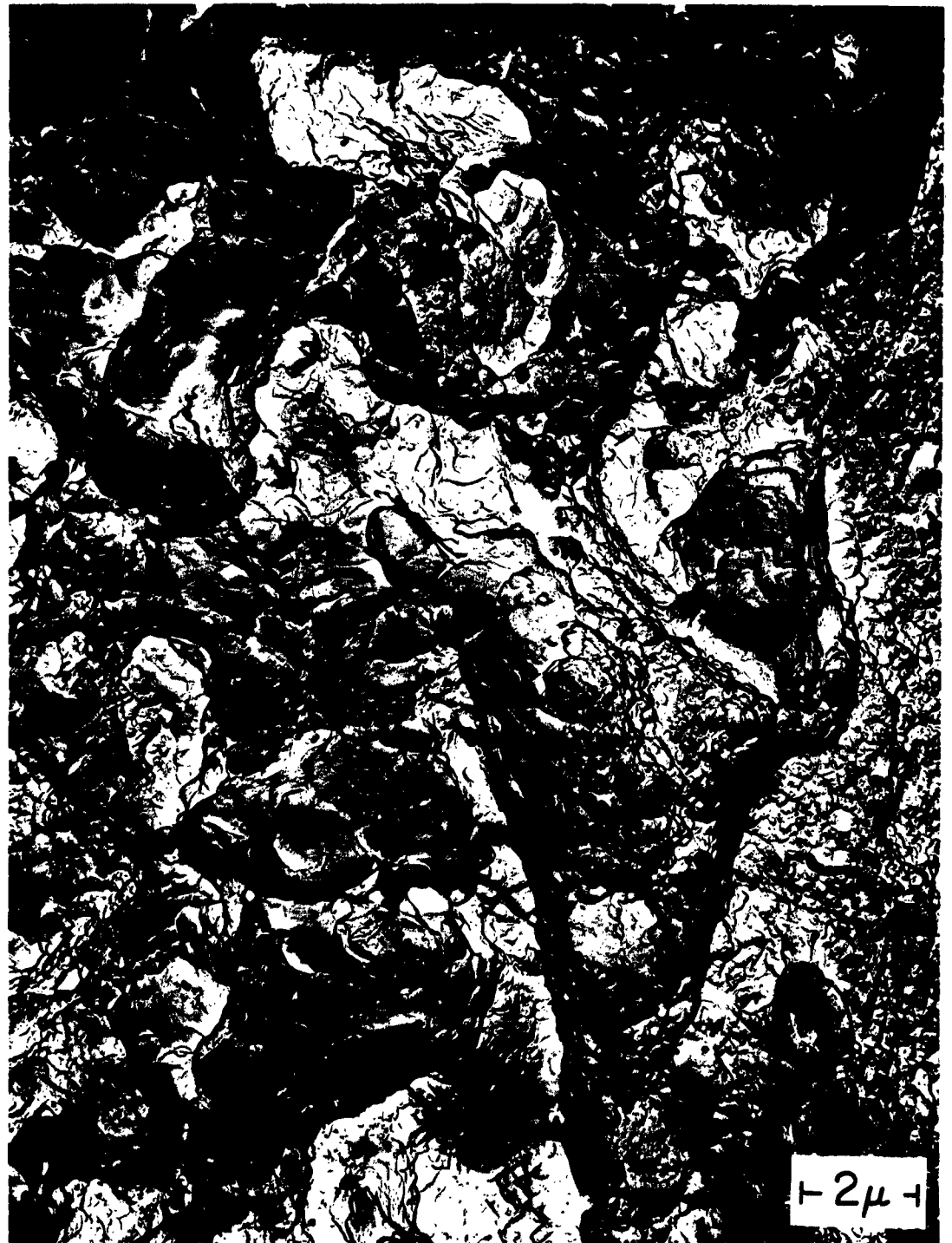
Fig. 3 - Dimpled rupture surface in the fast fracture region. Magnification 6,000X.