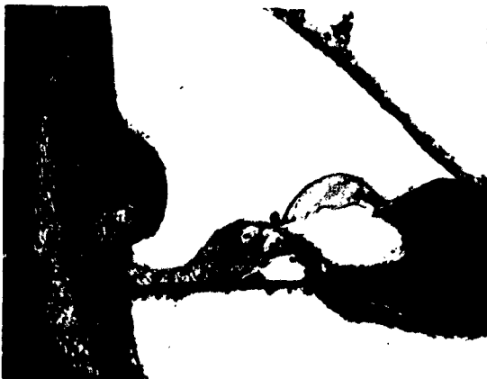
Figure 4. Lower part of the second turn of a section through the cochlea of a cat showing a Grade 4 injury. The external tunnel rod has been fractured. The reticular ruptured and external hair cells and supporting cells markedly altered. The internal hair and supporting cells show less marked changes. There is some loss of mesothelial cells. X 140.