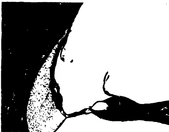
Figure 3. Middle part of the first turn of a section through the cochlea of a cat showing a Grade 3 Plus injury. Reissner's membrane is ruptured. The tunnel of Corti somewhat collapsed. Injury to the hair cells (not apparent at this magnification) could only be considered as moderate although the supporting cell changes were more severe. X 90.