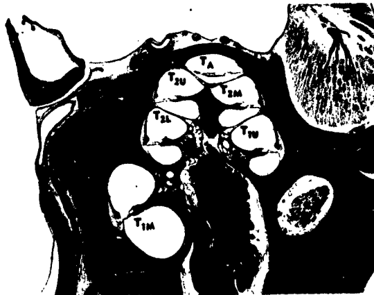
Figure 1. A mid-modiolar section through a cat's cochlea showing the different turns with the exception of the lower or basal portion of the first turn. T 1m , middle of first turn; T 1u , upper part of first turn; T 2L , T 2m , T 2u , lower, middle, and upper parts of second turn; T a , part of the small apical turn. X 12.