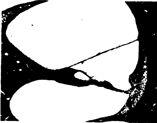
Figure 2. Middle part of the second turn of a section through the cochlea of a cat showing a Grade 3 Plus injury. The tunnel of Corti is completely collapsed and filled with cellular debris. The external and internal hair cells and supporting cells are markedly distorted with moderate changes. There is a loss of some mesothelial cells and degenerative limbic changes. X 90.