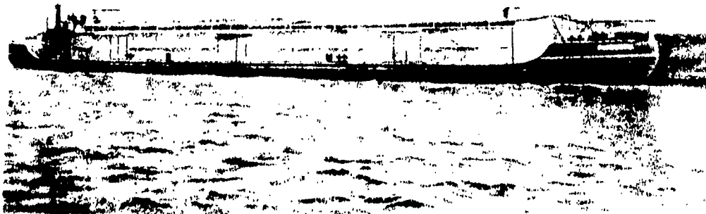
Illustration of barge.....