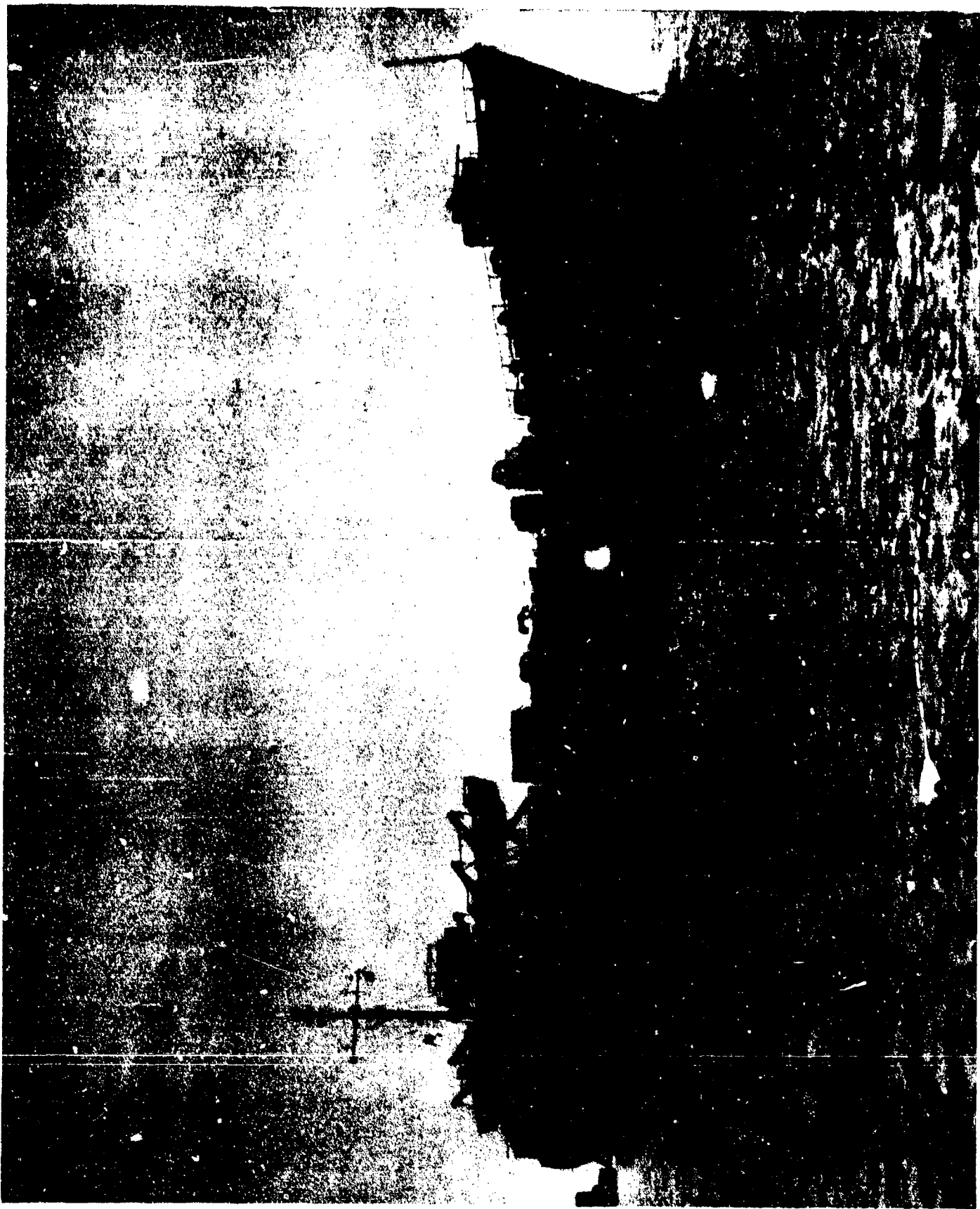
AB-CR-227-289-129. View from off starboard bow after Test B.