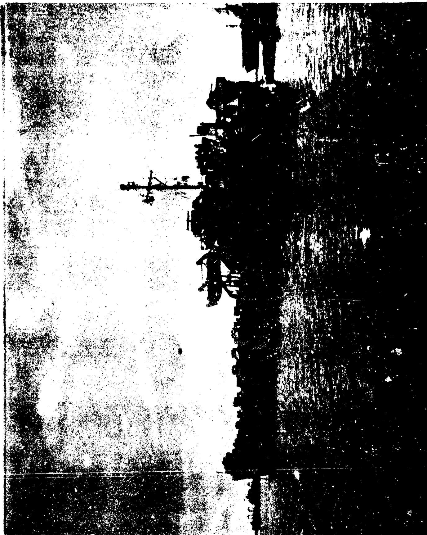
AB-CR-227-289-125. View from off port quarter after Test B.