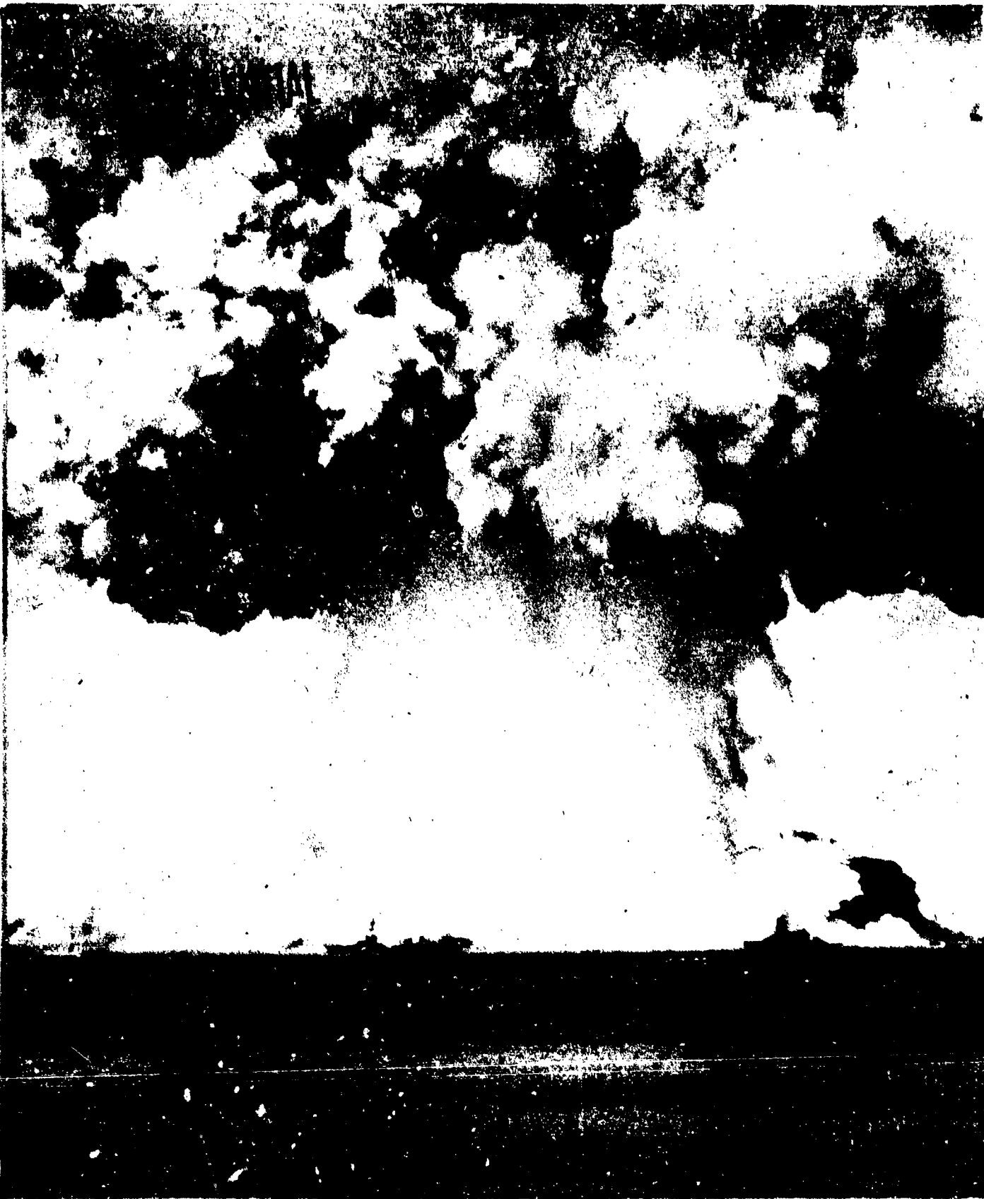
DB-CR-T2-233-270 Print #18. Last view of floating YO-160, .54 seconds after burst