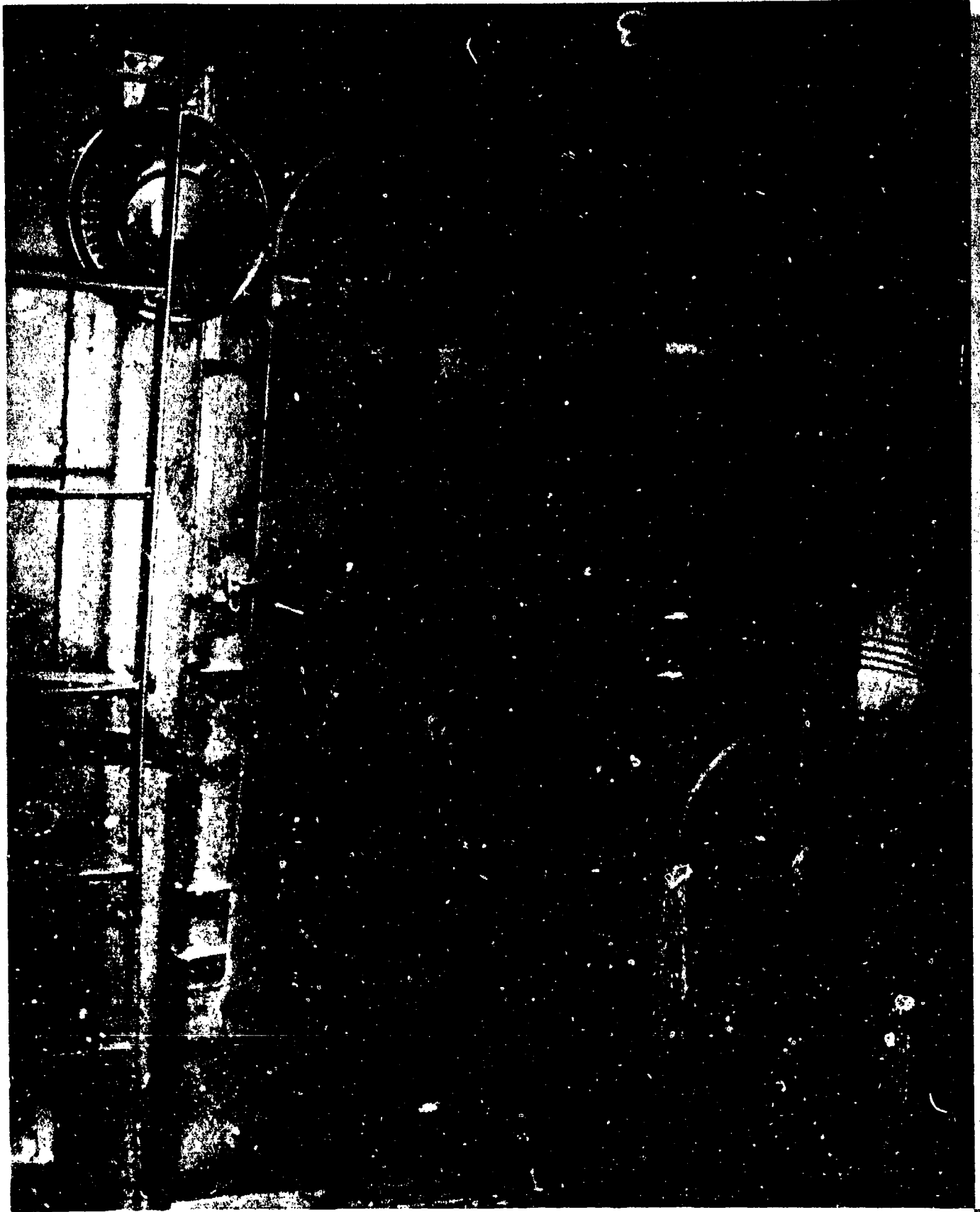
AA-CR-65-1727-3. Paint scorching on after quartering bulkhead of deck house, frames 156-159, starboard. Paint scorching is only one coat, the outer, deep.