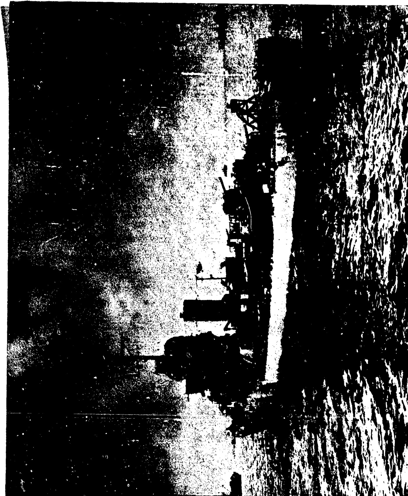
AA-CR-227-87-56. View from off port quarter. (Repainting of shell started.)