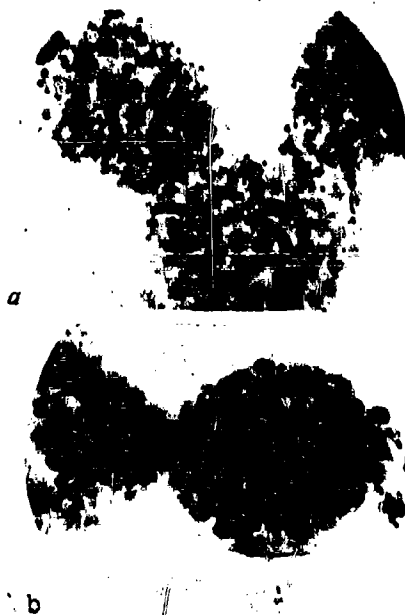
Fig. 4. Chloroplasts of beets grown at 2340 m above sea level from plants: a) unirradiated by additional UV, 7000X; b) irradiated with additional UV from quartz-mercury lamps, 7000X.