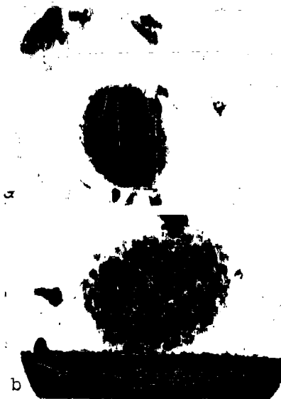
Fig. 5. Chloroplasts of radish cultivated at 2340 m above sea level from plants: a) unirradiated with additional UV, 7000X; b) irradiated with additional UV from quartz-mercury lamps, 7000X.