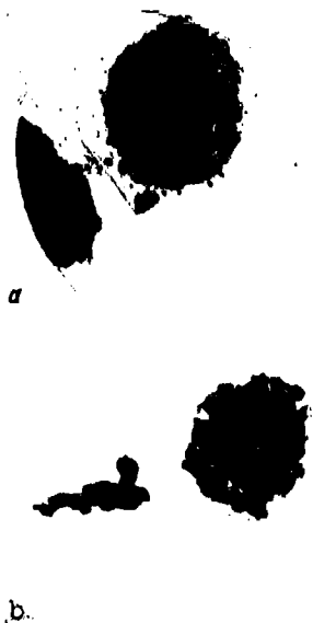
Fig. 3. Chloroplasts of plants cultivated at 4750 m above sea level. a) Primula turkestanica , 7000X; b) Swertia marginata , 7000X.