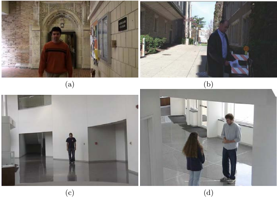
Fig. 2. Example frames from video sequences in the Video Challenge Problem. The images in (a) and (b) are from the U. of Notre Dame collection. The image in (a) is from a video sequence of a subject walking towards the cameras in an atrium and (b) is a subject performing a non-frontal activity outdoors. The images in (c) and (d) are from the U. of Texas at Dallas collection. The image in (c) is from a video sequence of a subject walking towards the cameras in an atrium. The image in (d) is acquired from a video camera looking down on a conversation. In (d), the subject whose face can be seen is the subject to be recognized.

first is an HD video sequences, and the second is a NIR video sequence. This experiment tests recognition from face and iris imagery.