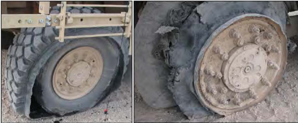
Figure 2. Sample of post-test photographs of left front and left rear wheel assemblies.