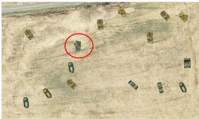
Figure 2: Example image from the Hard condition (notice that one of the beige tanks is moving in the opposite direction as the non-tank military vehicles. The target is circled in red (notice that it is a green tank, moving in the opposite as the non-tank military vehicles.

heading in the opposite direction of all other non-tank military vehicles (see Figure 2). The added variability of these distractor tanks made the task considerably more difficult, as confirmed with pilot testing. This increased difficulty was intended to increase mental workload while participants performed the difficult visual search task.