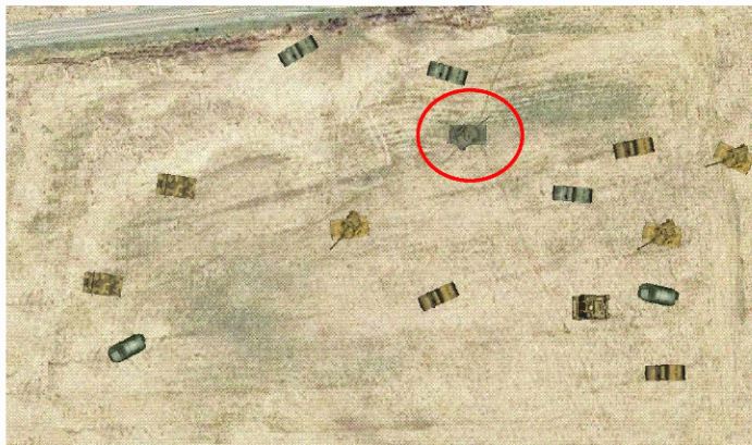
Figure 1: Example image from the normal difficulty condition (notice that none of the beige tanks are moving in the opposite direction as the non-tank military vehicles. The target is circled in red (notice that it is a green tank, moving in the opposite direction as the non-tank military vehicles).

of the left and right mastoid processes, and low-pass filtered at 30 Hz. The 1 second of EEG preceding each behavioral response was subset from the overall recorded EEG, divided according to whether the response was a hit, miss, false alarm, or correct rejection. Any 1 second pre-response epoch that contained activity exceeding \pm 75 \mu\text{V} on the ocular channels was rejected due to ocular artifact contamination. The mean log spectrum for the set of remaining epochs of each type was calculated, and the peak dB power in each of three frequency bands (theta: 4-7.5 Hz, slow alpha1: 7.5-10 Hz, fast fast alpha2: 10-13 Hz) was identified separately for EEG preceding each type of behavioral response, in each of the two difficulty levels, at three electrode sites of interest, Fz, Cz, and Pz.