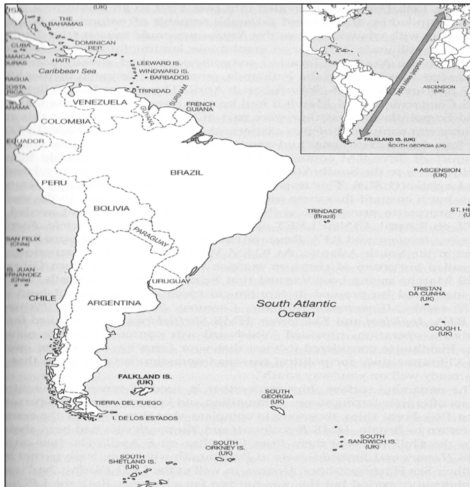
Figure 2: Strategic and Operational Distance. 14

The escalation of the Falkland crisis in March–April 1982 surprised the British Government and underscored the need to maintain a credible deterrent force in the area while clearly communicating foreign policy objectives. Figure 2 illustrates the geographical challenges that influence the British operational approach during the campaign.