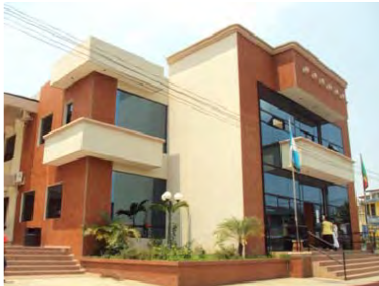
Malacatán's impressive office of the municipal government.

Unlike the municipalities of Sayaxché and Gualán, Malacatán is not only able to provide services, but also support popular cultural and recreational activities. One example is the city's support for its candidates in the San Marcos department's beauty contests. Out of the last five contests, the municipality has won three. In soccer as well, the local team has improved dramatically in recent years and attendance and support are part of the work agendas of the local government offices. Far from marginal, these are activities to which the public pays close attention, and the involvement of the municipal government elevates its relevance in the eyes of the community.