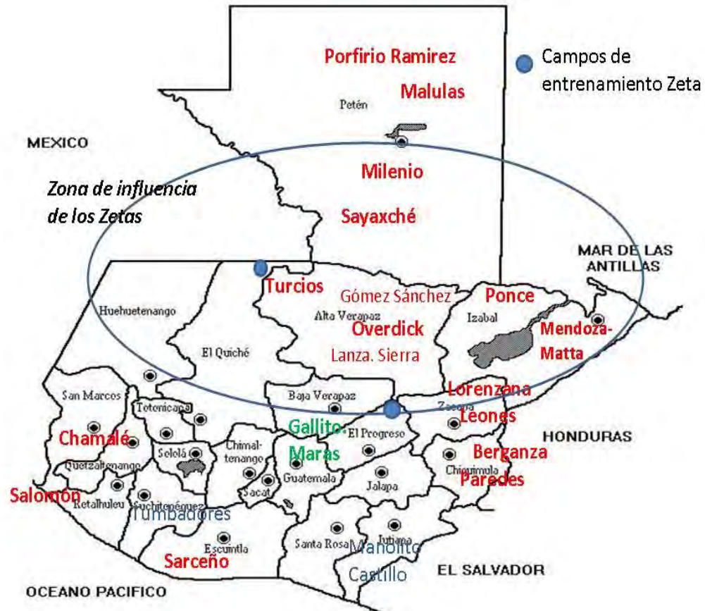
Map 3: Territories of key trafficking networks

This violent struggle among the cartels creates significant danger for the traditional capos , or transportistas , who have for decades managed criminal activity in certain regions of the country. These individuals and their families face decisions whether to align themselves with one or the other cartel, thus becoming potential targets for the other, or to seek to