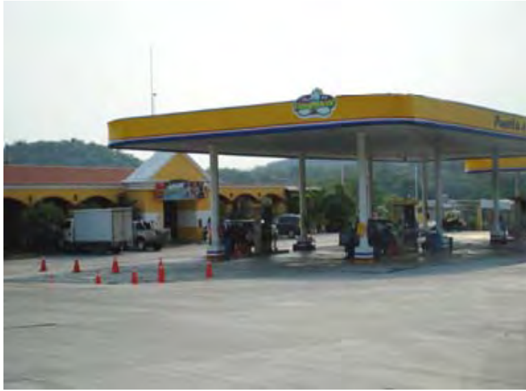
Example of new gas station in Gualán. Such stations are common means of laundering illicit profits.

The proliferation of private schools cannot be attributed solely to the activity and prosperity generated by tomatoes, or to the impact of such initiatives as PRONADE and Mi Familia Progres a. One instructor commented: