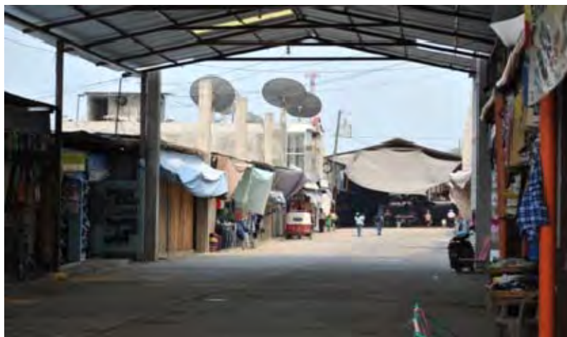
New Development – roofs, satellites dishes, new building – in a town near Sayaxché on the Mexican border

Interestingly, this new prosperity seems most pronounced in the small villages along the border with Mexico. Whereas normal contraband activity (e.g., of grains, sugar, etc.) provides only a subsistence level of profit, today’s incomes in these villages seem to support full-time schooling and new construction. Community residents point to this pattern as evidence that the municipality’s new, relative prosperity must be associated with drug trafficking, not traditional activity.