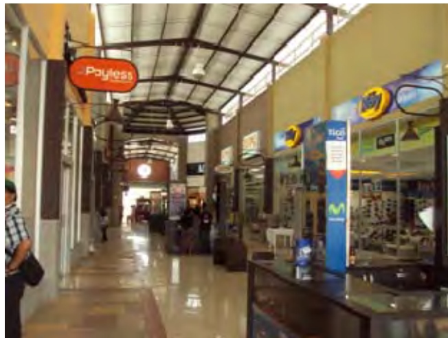
Advanced commerce and services in Malacatán.

Because of its rich soil, a range of micro-climates, diverse flora and fauna, and abundant river and irrigation systems, Malacatán has traditionally been a prosperous municipality. Traditionally, coffee producers have been the leading source of local employment; however, the industry has not regained the position it held as the principal activity in the area before the coffee price crisis of 2001, and the number of jobs that it provides has not returned to previous levels. Cultivation of African palm has been increasing in the area in terms of fields planted and permanent employment, although the total area planted is less in Malacatán than in neighboring municipalities. Although there are no local employment statistics, Malacatán currently appears to be a municipality with practically “full employment.” Demand is high for unskilled labor for coffee harvesting and in the African Palm plantations. Malacatán also benefits from high quality infrastructure, by Guatemalan standards, built over the last century in response to the needs of the coffee industry.