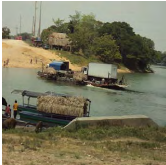
Informal crossing on the Rio de la Pasión near Sayaxché

“The transfer is fast because it is loaded onto big twin engine launches that head up river. Remember that the Pasión [river] goes to Usumacinta and to Mexico. Those who have become involved in that have done okay but it is risky, not because the police might catch you, as it’s been a long time since we’ve seen an agent of the National Civilian Police, but because when another group wants to steal your shipment, you’re the first ones they look for, and even if you give them information, they’ll still kill you.” 30