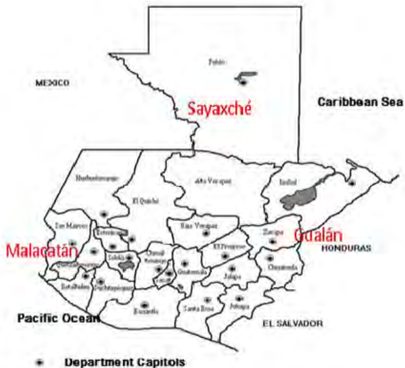
Map 1: Geographical Location of the Three Case Studies

The communities included in this study differ significantly across a spectrum of political, economic, and social characteristics. These differences lead to variations in the political systems and institutions, their relationships with the national government and security forces and the interactions between the criminal organizations and the community.