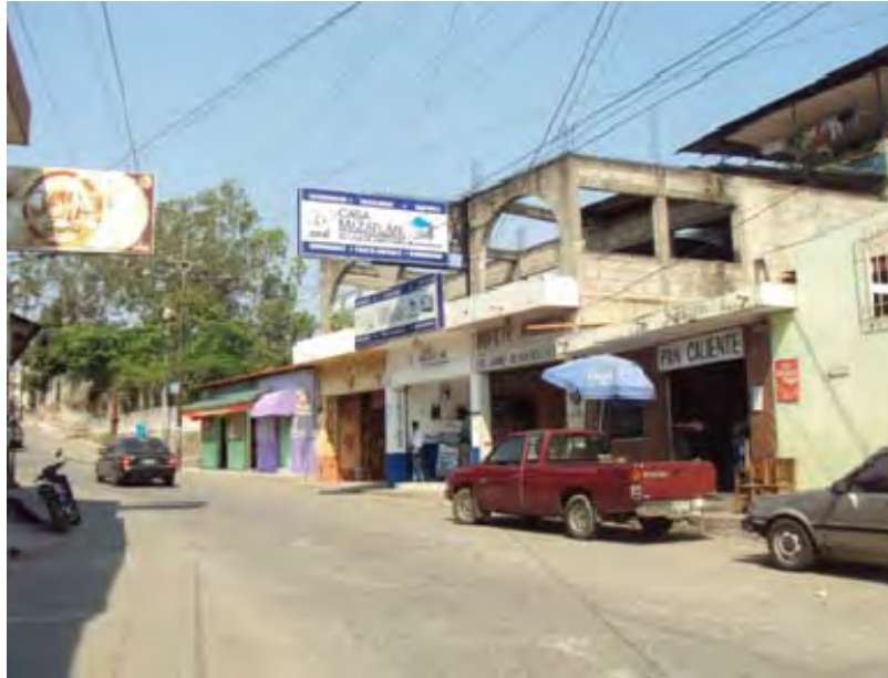
New financial services and other business in Gualán

reactivated Oaxaca irrigation system. This further increased the availability of money for the cultivation of tomatoes. 35