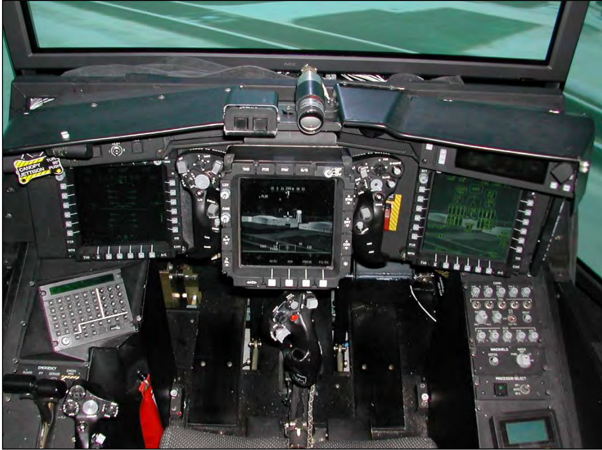
Figure 1. AH-64D Apache Longbow cockpit and displays.

ARL HRED conducted two pilot workload assessments for unmanned aerial system (UAS) teaming using the RACRS. The assessments evaluated the video from UAS for Interoperability Teaming Level II (VUIT-2) system (Hicks et al., 2009) and the integrated UAS (IUAS) system (Durbin and Hicks, 2009) that were being incorporated into the aircraft. VUIT-2 provided the ability to conduct level II UAS interoperability (receive video from the UAS). The IUAS system provided the aircrew with the capability to conduct level II, level III, and level IV UAS interoperability (receive video from the UAS and control of the UAS sensor and air vehicle).