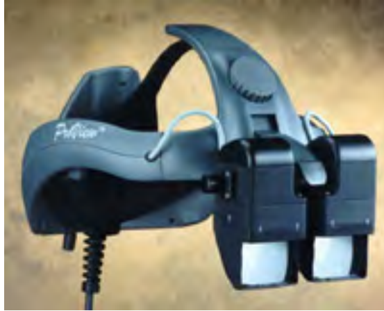
Figure 6. Kaiser ProView 50.