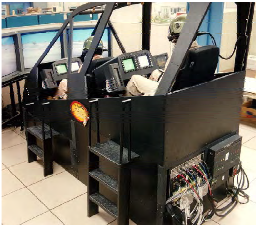
Figure 4. CPC simulator.

The CPC (figure 4) and EDS (figure 5) each consisted of two Comanche crewstations arranged in a tandem seating configuration. The front and rear crewstation configurations were identical (figure 4), enabling each pilot to perform all aircrew navigation, communication and weapons employment tasks. The simulators contained the hardware and software that emulated the controls, flight characteristics, and most of the functionality of the proposed Comanche production aircraft. The EDS was a full motion simulator and the CPC was a fixed-base simulator. The EDS motion was the only significant difference between the simulators. The EDS and CPC were used by ARL HRED to assess the crewstation design during the RAH-66 Force Development Test and Experiment 1 (Durbin et al., 2003).