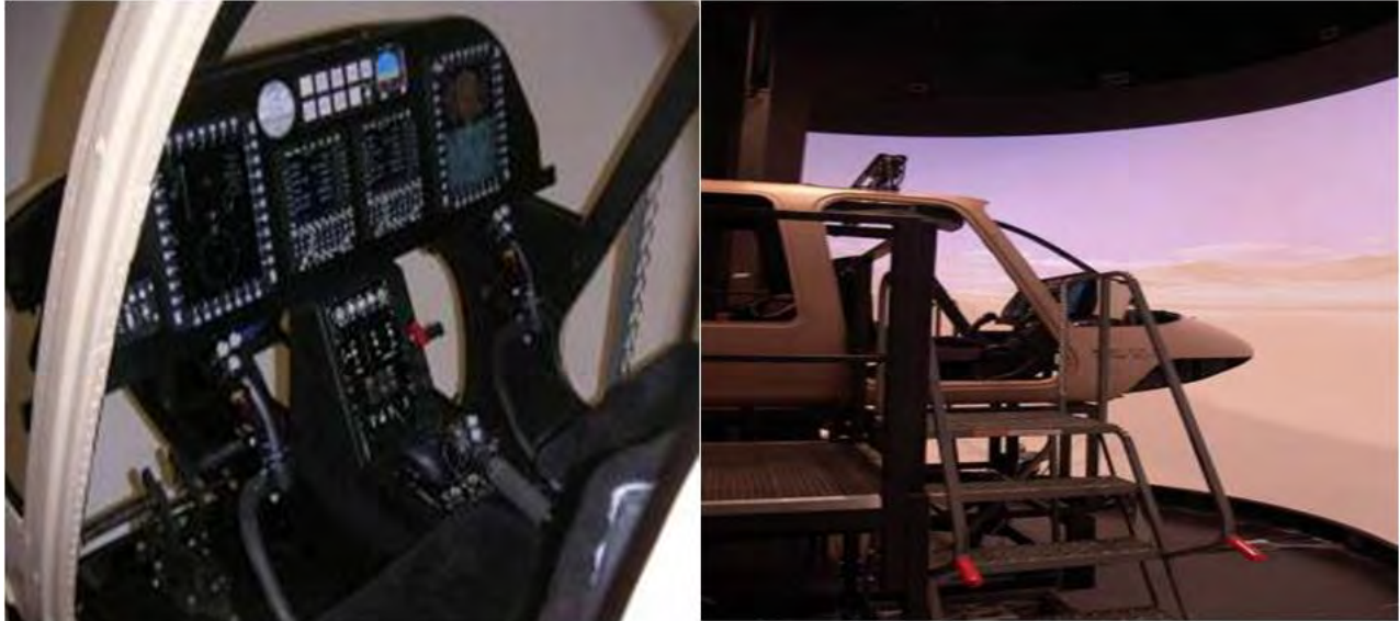
Figure 9. ARH BHIVE 2 cockpit and simulator.