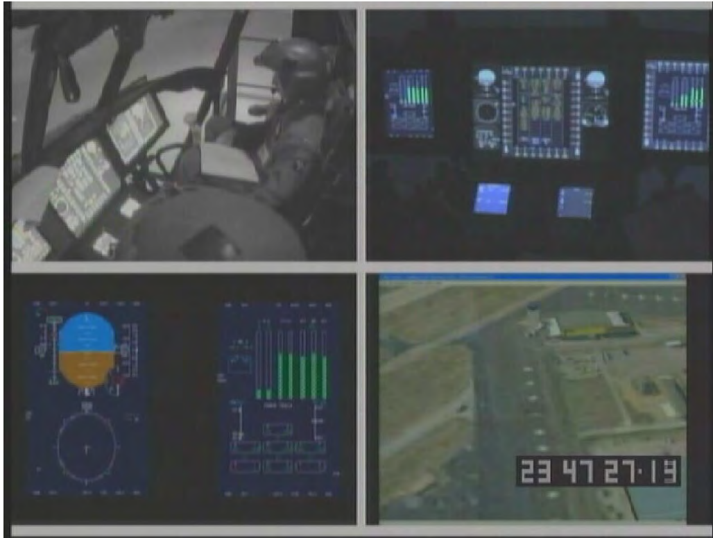
Figure 10. CH-EAC cockpit and displays.