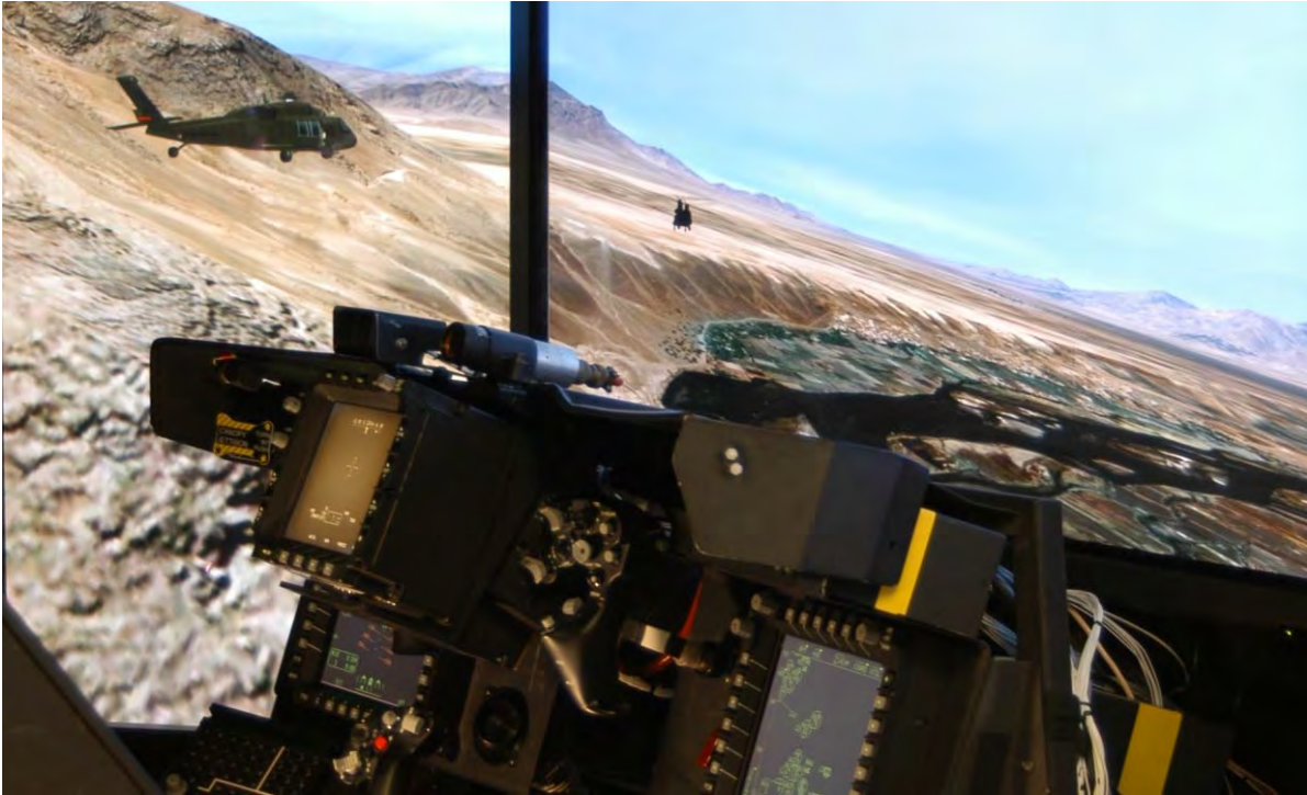
Figure 3. Bagram, Afghanistan visual database.