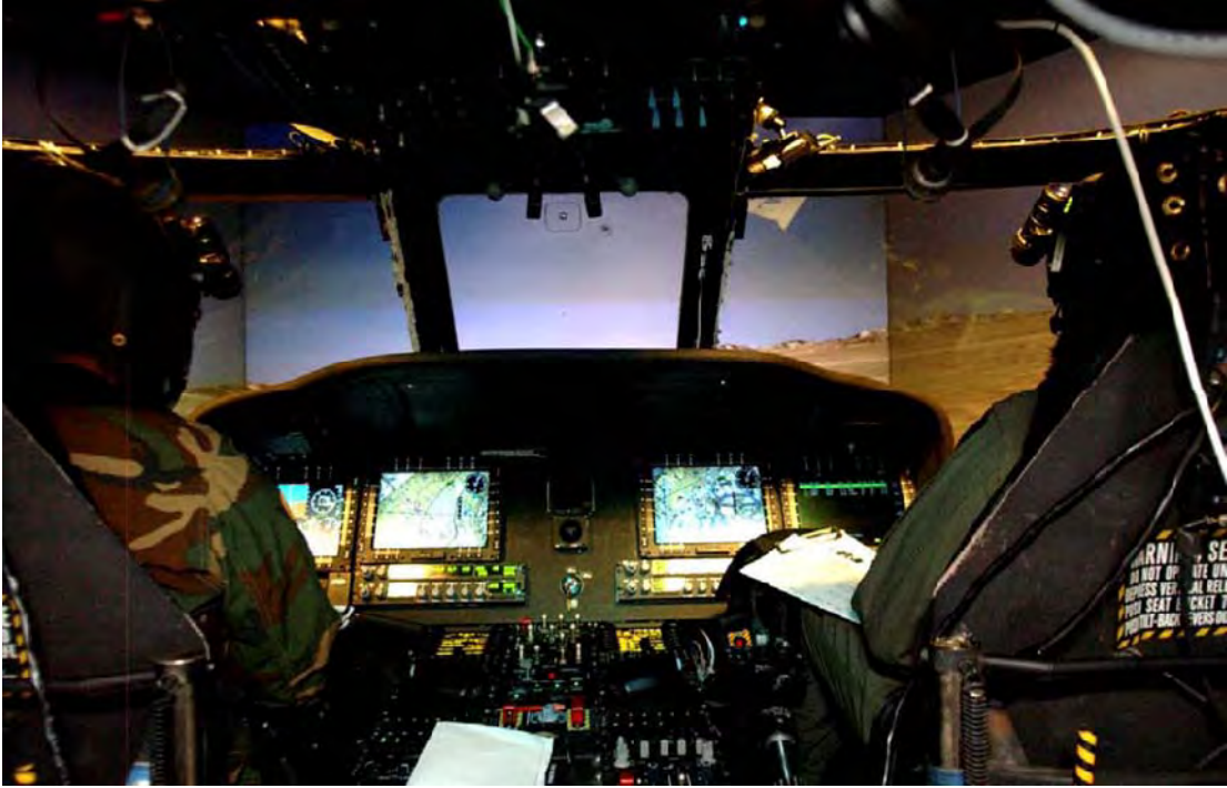
Figure 8. UH-60M SIL cockpit view.