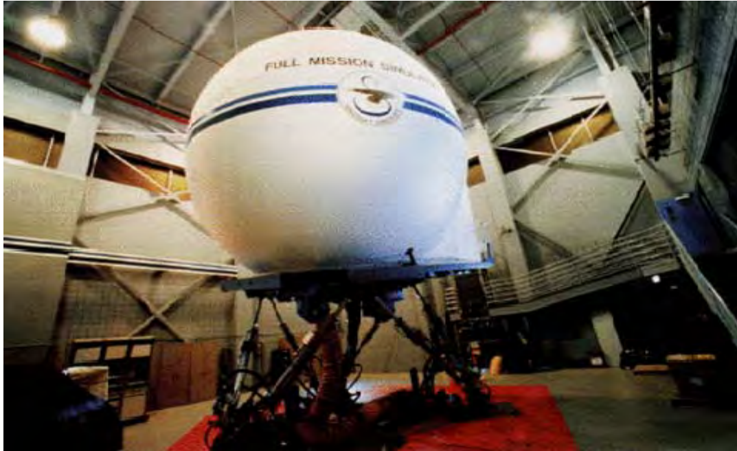
Figure 5. EDS simulator.

The Kaiser ProView 50* (figure 6) was the helmet mounted display (HMD) used by all of the pilots in the EDS and CPC. It had two liquid crystal displays with 28^\circ (V) \times 49^\circ (H) field-of-view (25% binocular overlap), 1024 \times 768 resolution, inter-pupillary distance adjustment, eye relief adjustment, adjustable headband and strap, an electronic control unit, and a Polhemus head-tracking sensor. The weight of the HMD was 1.3 lb. The HMD provided the out-the-window display to the pilots via a synthetic visual scene overlaid with monochrome symbology. When used in the night vision pilotage system (NVPS) mode, the HMD displayed the forward-looking infrared (FLIR) scene overlaid by the monochrome symbology. A headset was placed over the HMD to provide the pilots with the capability for radio and inter-cockpit communication.