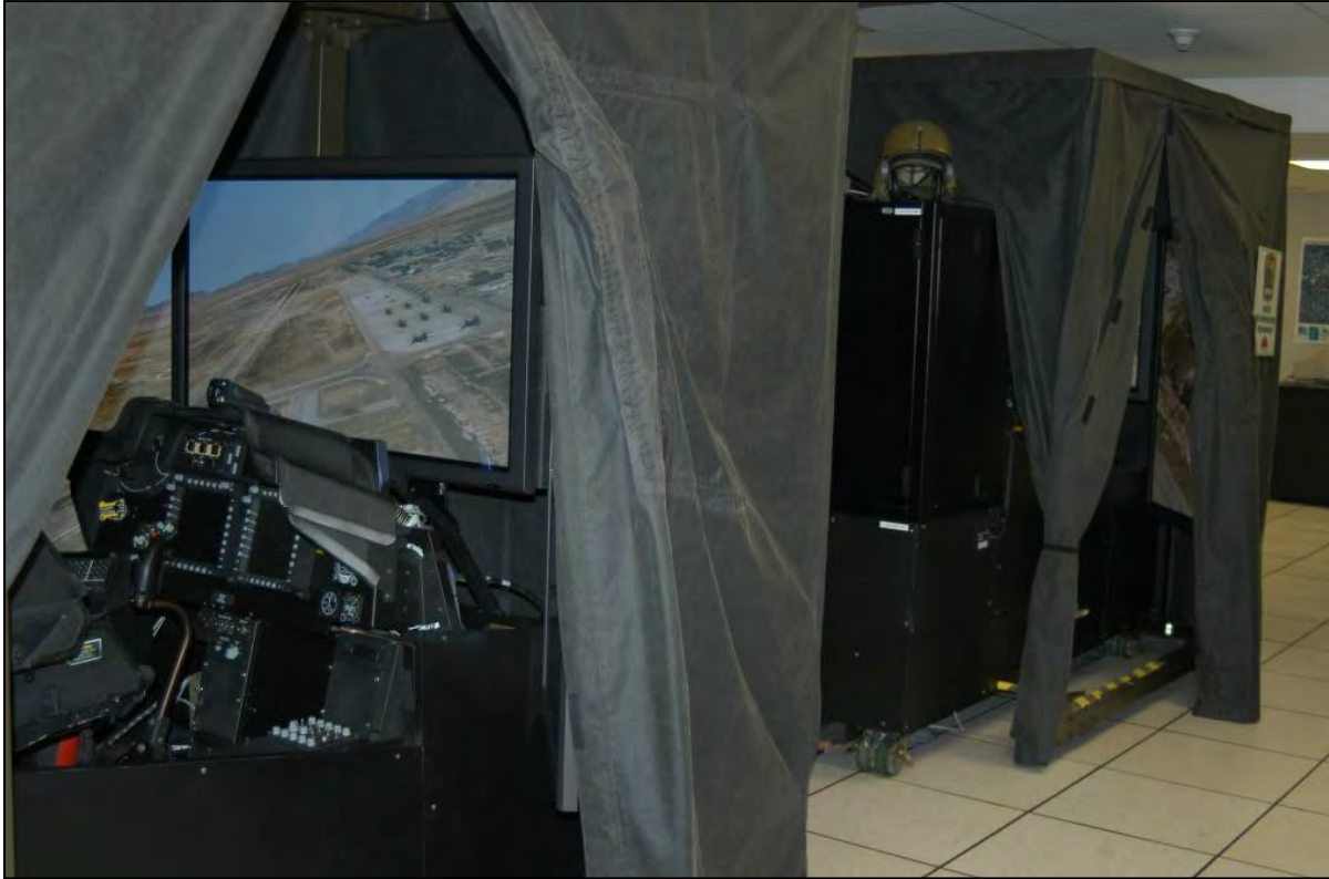
Figure 2. RACRS cockpit simulator.

The simulator visual system was configured to fly the existing Bagram, Afghanistan, visual database (figure 3). This is a geo-specific large gaming area built from satellite acquired high-resolution imagery and detailed terrain relief. It also contained appropriate cultural features to increase realism for the pilots.