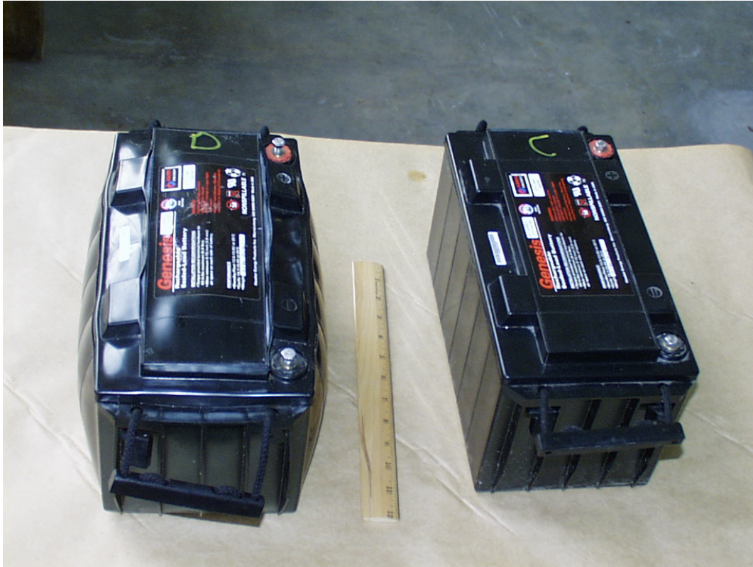
Figure 4. Thermal runaway consequence as observed by the author.