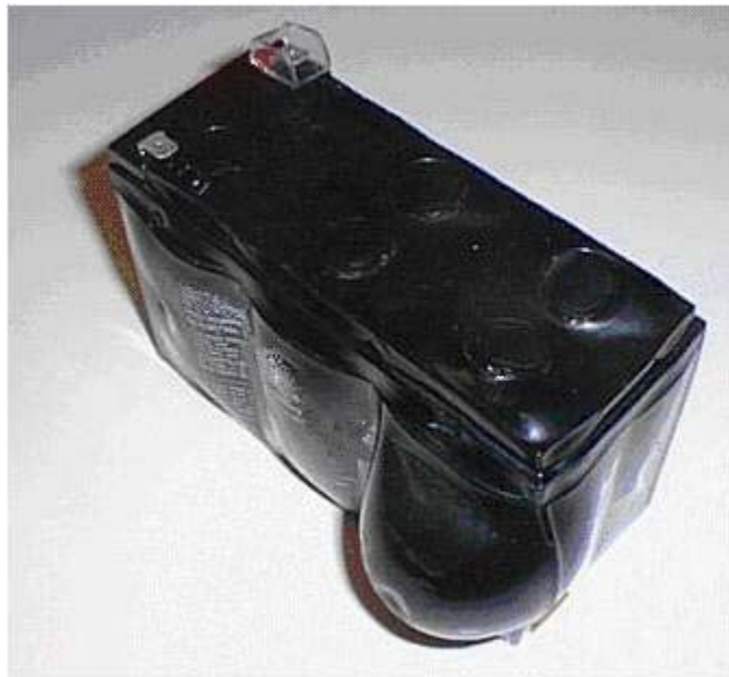
Figure 3. Battery deformation that resulted from a thermal runaway. [5]