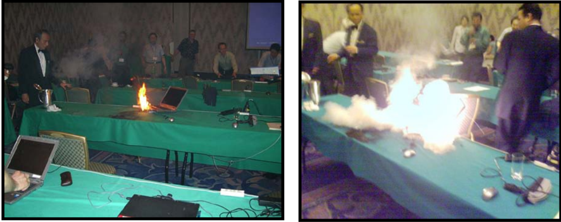
Figure 1. Photographs of a laptop fire taken with a cell phone camera and published on the Internet.

The thermal runaway effect is a characteristic of sealed cells. This is to be distinguished from the vented flooded designs that do not exhibit this effect. As a note of caution, it is important to point out that it is possible to put a flooded cell into thermal runaway by allowing the electrolyte level to decrease to the point where one simulates a starved electrolyte environment. One can induce the thermal runaway in these cases. However, the operation of that cell is well outside of its normal operating bounds.