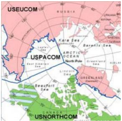
Figure 3. Current Unified Command Plan divisions in the Arctic 90