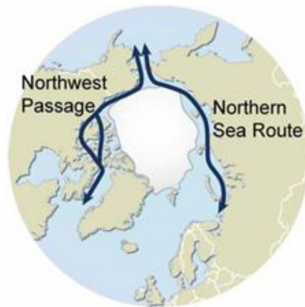
Figure 2. Location of the Northwest Passage and Northern Sea Route 89