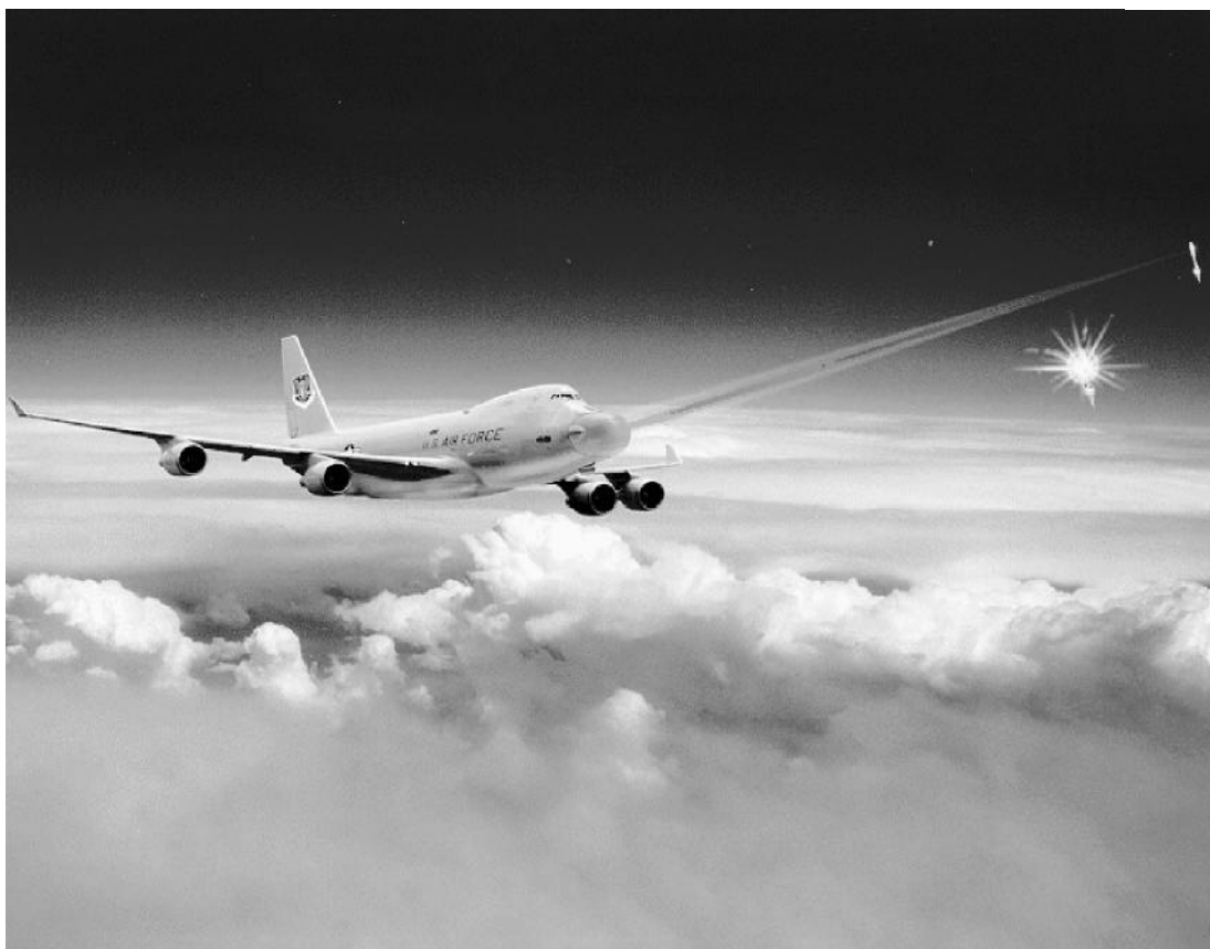
Depiction of the airborne laser (ABL) engaging theater ballistic missiles in the boost phase of flight. "[One cannot] see the Air Force building the material, cultural, and organizational foundations of a service dedicated to space power." Do Air Force plans and programs reflect cultural bias or realistic solutions to technical, fiscal, and political constraints?

to smother those people who would offer us the most innovative and revolutionary visions for exploiting space. The emergence of a real space-power force will require the creation of a highly skilled, dedicated cadre of space warriors clearly focused on space-power applications—not merely on helping air, sea, and ground units do their job better.