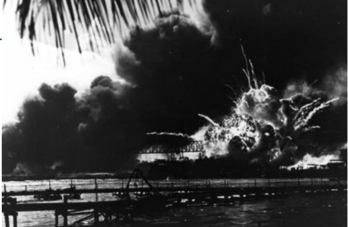
USS Shaw exploding, December 7, 1941.