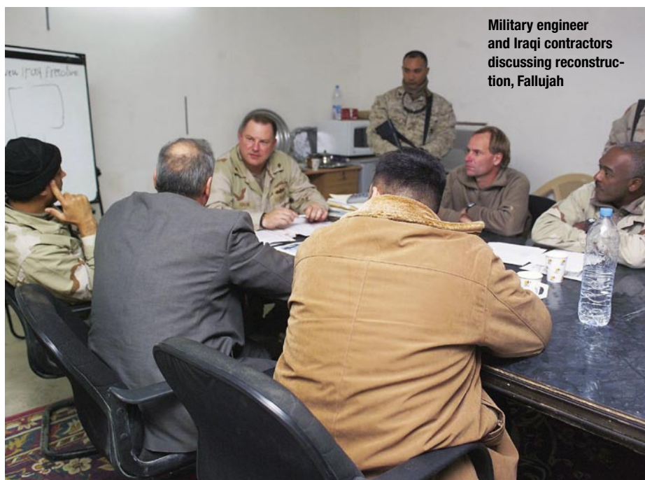
Military engineer and Iraqi contractors discussing reconstruction, Fallujah