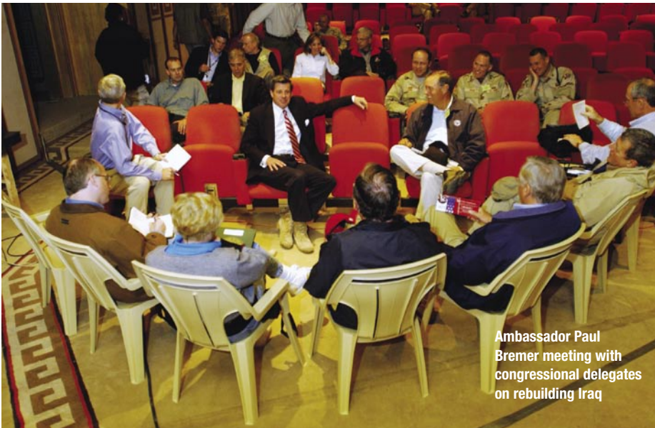
Ambassador Paul Bremer meeting with congressional delegates on rebuilding Iraq