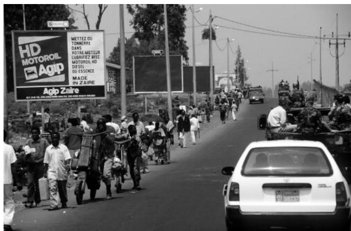
Figure 1. Refugees making their return journey to Rwanda in 1994 line the streets in Goma, Zaire.

Countries which used to be a source or transit country for illegal immigration may well become unintended destination countries as a result of the governments' current enforcement of immigration policies and surveillance of the borders at an originally-intended destination country. In the last decade, for example, Morocco -- which is a transit country to the European Union through the strait of Gibraltar, the Canary Islands and the two occupied cities Ceuta and Melilla -- has known an incredible rise in illegal immigrant residents, mostly natives of the West and East African countries. According to the Moroccan "Gendarmerie Nationale", a large percentage of those undocumented immigrants are from countries of the Niger Delta enduring instability, civil war, and interstate conflicts. 12 In a parallel way in Europe, by the end of 1998 the ex-Yugoslavian conflict had generated a significant displacement of population; estimated according to the United States Committee for Refugees at 992,200 refugees and 1,203,000 internally displaced people. 13 Many of them, fleeing ethnic cleansing perpetrated by the Serbo-Bosnian forces, had tried to cross European Union boundaries illegally.