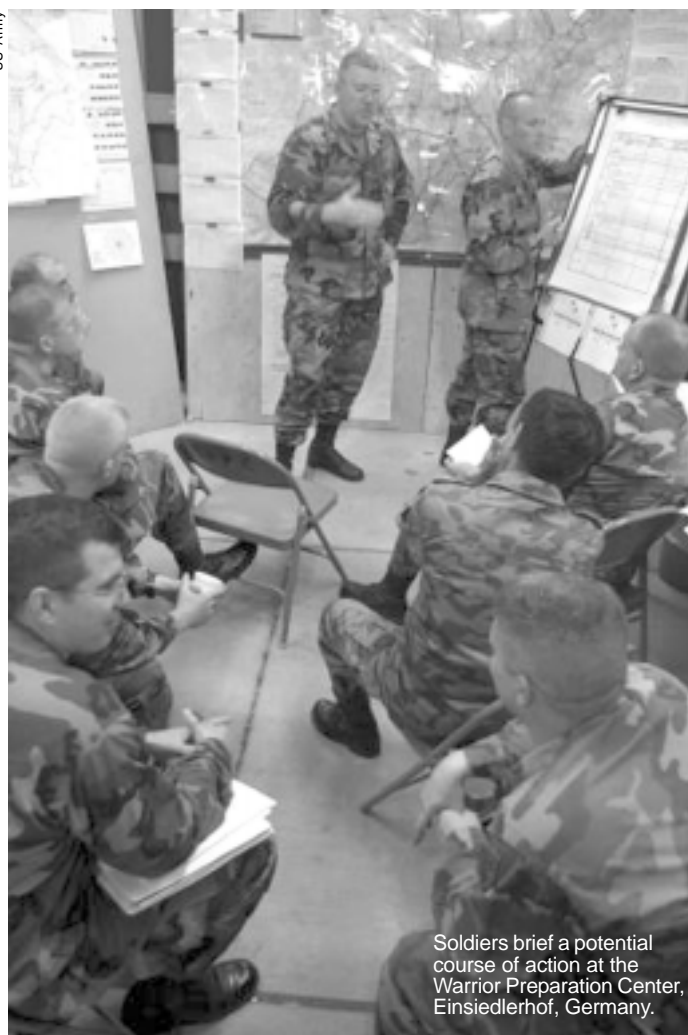
Soldiers brief a potential course of action at the Warrior Preparation Center, Einsiedlerhof, Germany.

COA. 13 The new process provides an organized method for staff members as well as subordinate commanders to question the commander's thinking behind the COA. This process took place spontaneously during the exercise, but some participants emphasized the possible benefits of such a deliberate process in situations where the commander is not naturally expressive.