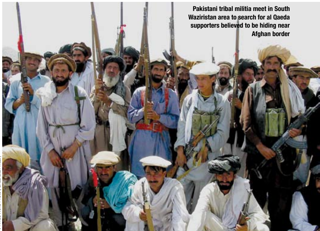
Pakistani tribal militia meet in South Waziristan area to search for al Qaeda supporters believed to be hiding near Afghan border

On December 13, 2001, ISI-sponsored Lashkar-e-Taiba militants attacked India's parliament in New Delhi. When India went to a war footing, Musharraf ordered the arrest of 50 LET members and banned certain militant groups, declaring he would not allow terror-