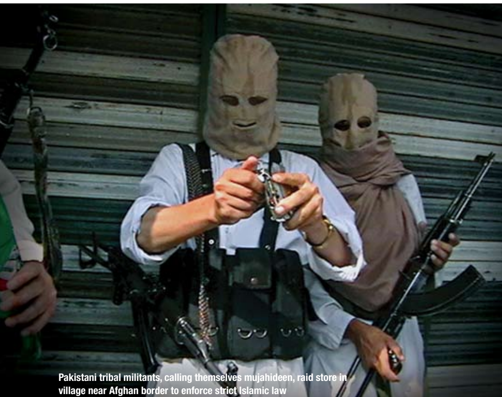
Pakistani tribal militants, calling themselves mujahideen, raid store in village near Afghan border to enforce strict Islamic law

ISI took Saudi money to fund madrasas , which indoctrinated extremists, providing militants to fight India in Kashmir. Madrasas became recruiting and training pipelines whose graduates played key roles in the Taliban and Kashmiri terrorist groups. They