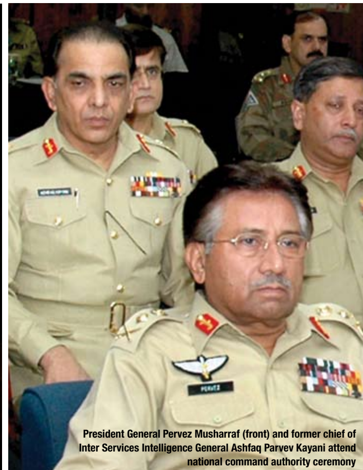
President General Pervez Musharraf (front) and former chief of Inter Services Intelligence General Ashfaq Parveez Kayani attend national command authority ceremony

AP/Wide World Photo (Inter Services Public Relations)