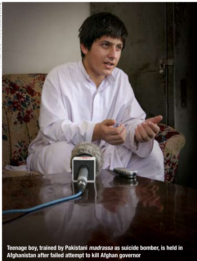
Teenage boy, trained by Pakistani madrassa as suicide bomber, is held in Afghanistan after failed attempt to kill Afghan governor