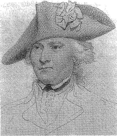
Major General Arthur St. Clair