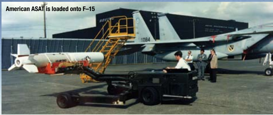
American ASAT is loaded onto F-15