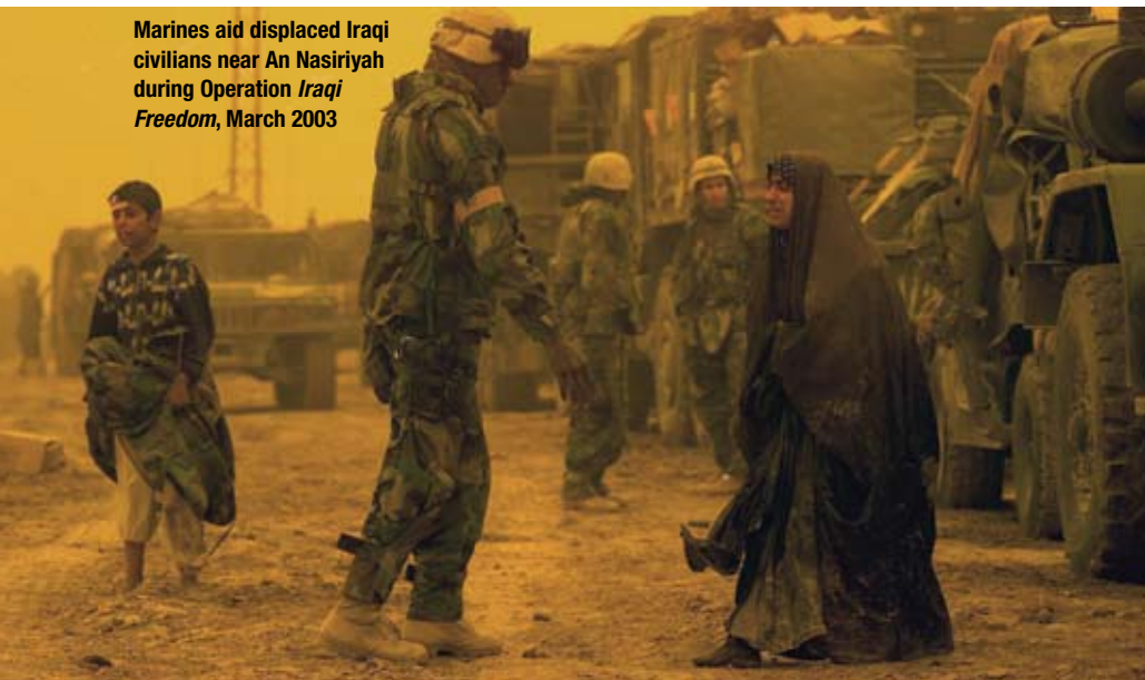
Marines aid displaced Iraqi civilians near An Nasiriyah during Operation Iraqi Freedom, March 2003

DOD recognizes the need for fresh thinking and has begun exploring the nature of this mixed challenge. An ongoing research project, including a series of joint wargaming exercises, has been initiated by the Office of the Secretary of Defense. U.S. Joint Forces Command is exploring the implications as well, and the