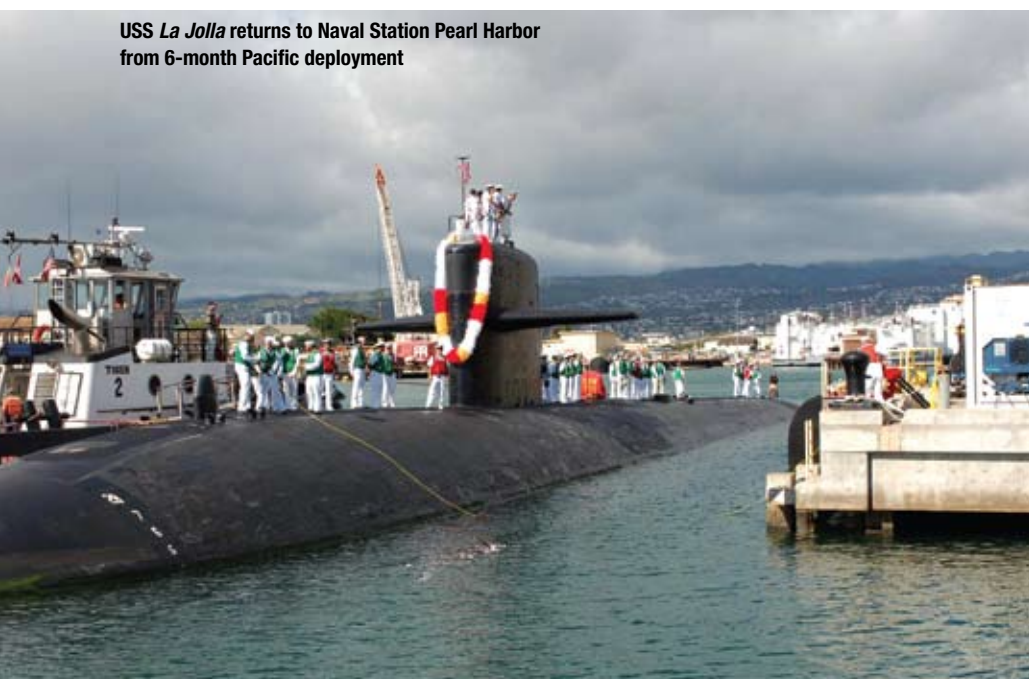
USS La Jolla returns to Naval Station Pearl Harbor from 6-month Pacific deployment

A commander thinks operationally when he possesses an operational rather than tactical perspective in exercising his numerous responsibilities, both in peacetime and in war. In purely spatial terms, the operational perspective encompasses the (formally declared or undeclared) theater of operations plus an arbitrarily defined area of interest. The perspective of a tactical commander is much smaller because he is focused on planning and executing actions aimed at accomplishing tactical objectives in a given combat zone or area of operations. The broadest perspective is required at the military and theater-strategic levels of command. Among other things, the strategic perspective requires the commander's ability to translate objectives of national policy and strategy into achievable military or theater-