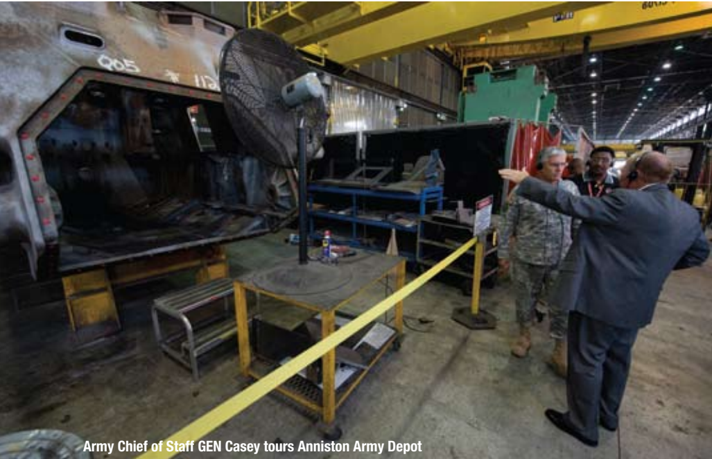
Army Chief of Staff GEN Casey tours Anniston Army Depot

SOD proponents falsely claim that intelligence preparation of the battlefield (IPB) is most suitable for the tactical but not higher levels of war. In their view, IPB deals only with physical reality. Its mechanistic and reductionist processes are more appropriate