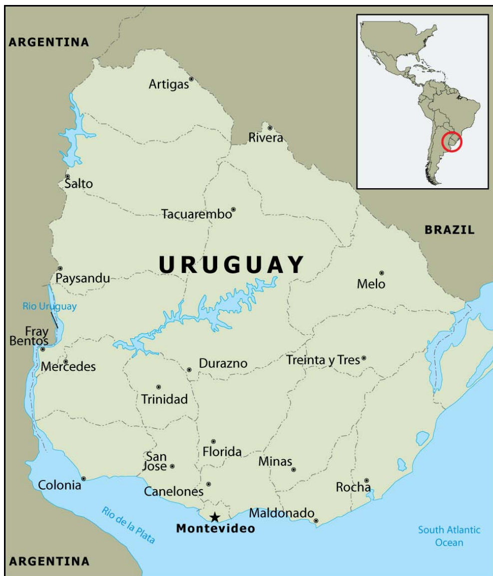
Figure 1. Map of Uruguay