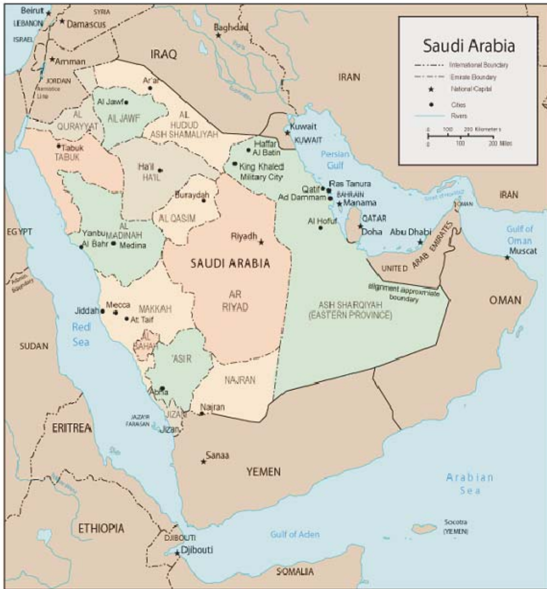
Figure 1. Map of Saudi Arabia