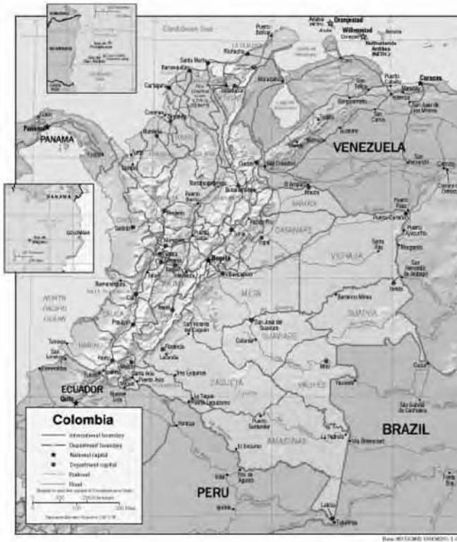
Map of Colombia.

actively patrol rural Colombia, providing presence in areas of conflict and assisting in the counternarcotics campaign.