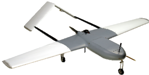
Figure 3. The Manta UAV Block B

carry a hyperspectral imaging unit and other advanced cameras. There was a similar desire for low life cycle costs, ease of operation, flight duration and long range operation and these requirements have been met using a similar approach to that used for Silver Fox, however, the forward deployed real time surveillance requirement has been lessened due to the uniqueness of the various payloads and the use in more specialized operations. Although the Manta presently requires a paved area for recovery, a catapult system was developed for maritime operations as shown in Figure 4 and an autonomous recovery capability is presently under development to meet future maritime needs.