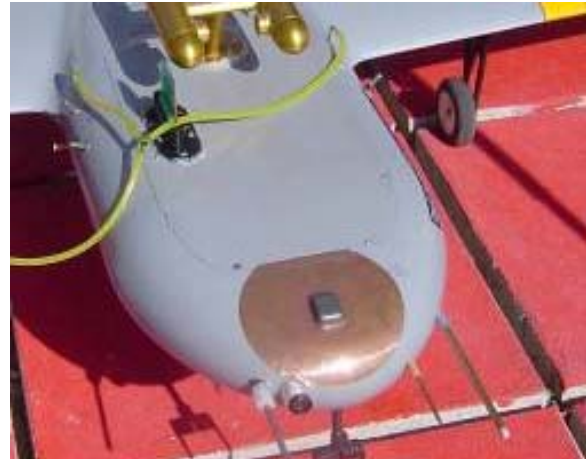
Figure 12. Payload for the in-cloud UAV showing the cloud droplet probe and total water probe on top of the payload with the transmitting antenna, video camera and three aerosol sampling probes at the front of the payload.

of the middle UAV with respect to the cloud, particularly when flying out of visible range, prompted the installation of a small video camera as shown in Figure 12 together with multiple aerosol measuring probe inlet tubes.