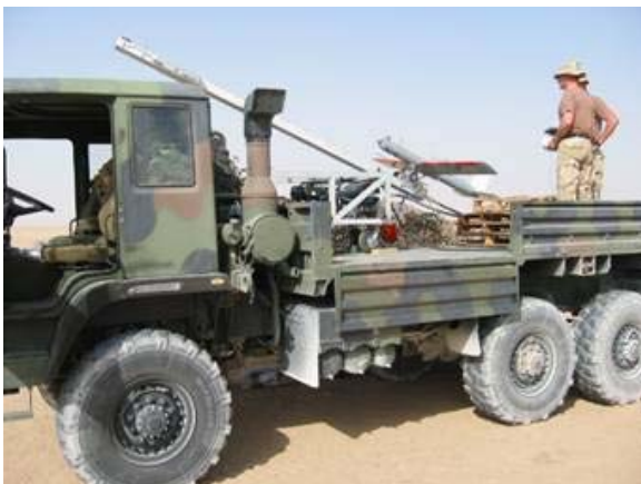
Figure 2. Navy operators with early pneumatic launched versions of the Silver Fox UAV.

The initial success of the Silver Fox and the ease of launch and recovery gained support within the Navy with the goals of providing an organic intelligence capacity, in real-time, to small contingents of forward deployed military personnel. The design goals of the Silver Fox system were based on feedback from Navy operators who fielded 2003 versions of the UAV in Kuwait as shown in Figure 2.