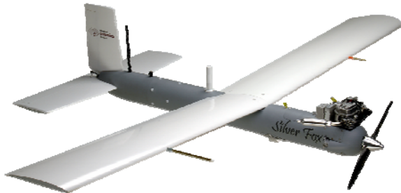
Figure 1. Silver Fox Block – B4 UAV

Silver Fox - The Silver Fox UAV was first designed and built in 2001 to meet a US Navy requirement to search for and monitor the movement of whales. The Silver Fox Block – B4, shown in Figure 1 has gone through several changes but has essentially remained the same size and shape with a 5 inch (0.127m) fuselage and a 94 inch (2.4m) wingspan