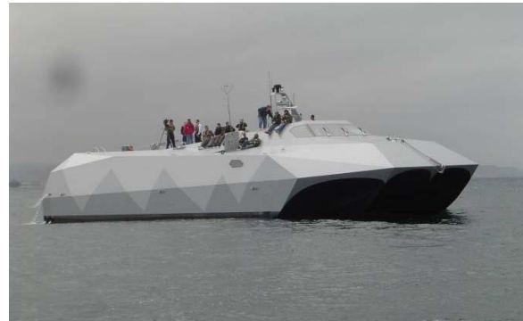
Figure 7. The Stiletto experimental hull vessel – littoral platform for unmanned vehicles

experiments with other advanced hull forms which will include the "X-Craft" and the "Stiletto" as shown in Figure 7.