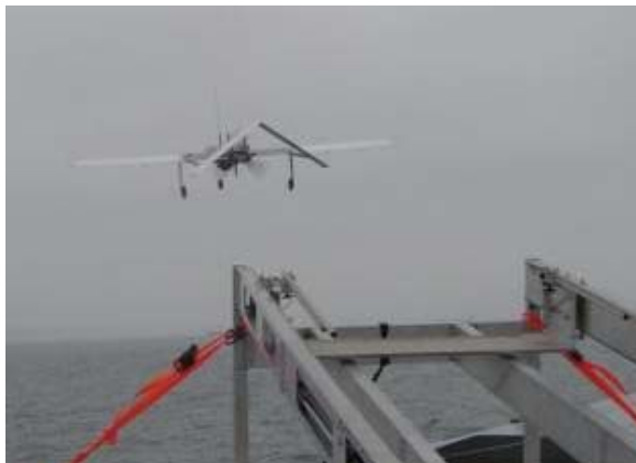
Figure 4. Manta UAV being catapult launched from the Stiletto Experimental Hull Vessel.

carry a hyperspectral imaging unit and other advanced cameras. There was a similar desire for low life cycle costs, ease of operation, flight duration and long range operation and these requirements have been met using a similar approach to that used for Silver Fox, however, the forward deployed real time surveillance requirement has been lessened due to the uniqueness of the various payloads and the use in more specialized operations. Although the Manta presently requires a paved area for recovery, a catapult system was developed for maritime operations as shown in Figure 4 and an autonomous recovery capability is presently under development to meet future maritime needs.