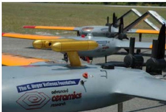
Figure 11. The in-cloud Manta UAV showing the cloud droplet probe on top (front) and above and below-cloud UAVs (behind), prior to take off.

Approximately 8 different sensors were flown in the stacked formation to collect the required data. The top and bottom UAVs had similar payloads but the middle UAV required a different payload as this UAV collected data from within the cloud. Figure 11 shows the in-cloud UAV equipped with the cloud droplet sensor mounted on top of the payload in “clean” air with the below and above cloud UAVs in the background. Several modifications were made to the sensor placement and the fuselage as the sensors were test flown and the data was collected.