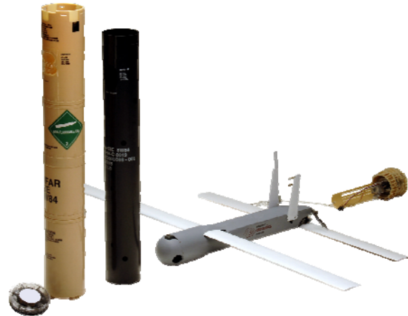
Figure 5. Coyote UAV and sonobuoy packaging

Coyote – The Coyote was build for a specific design requirement that it could be stored and launched from a standard sonobuoy tube as shown in Figure 5.