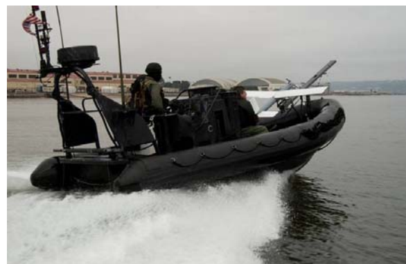
Figure 8. Silver Fox UAV ready for launch at the front of a 36 ft (11m) RHIB operated by NSCT1

In April 2006 a military exercise called Howler was arranged to demonstrate the collaborative use of UUVs and UAVs from the Stiletto experimental hull for the purpose of littoral mine clearance. Earlier work with NSCT1 had transitioned the Silver Fox from a land based asset to one that could be launched from a 36 ft (11m) Rigid Hull Inflatable Boat (RHIB) as shown in Figure 8 that could also be recovered from a water landing. For the Howler exercise the RHIB is stored within the body of the Stiletto and launched from the aft facing entrance at water level.