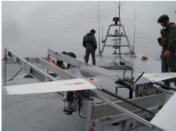
Figure 9. The Manta UAV on the launcher on the upper Stiletto deck from where it is launched.

capable of surveying scanned regions of ground or water and establishing the position of anomalies such as sub surface mines. A Manta launcher was developed as shown in Figure 9 that allowed the Manta to be launched directly from the upper Stiletto deck. For the exercise the Manta was recovered on land but for future capability, ship recovery is desired and is presently under development.