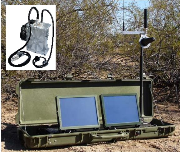
Figure 6. Military ground control station showing C2 flight control and data imagery screens. The miniaturized GCS is shown to scale (insert).

driven the design to a single, self-powered iGCS containing two user interfaces as shown in Figure 6.