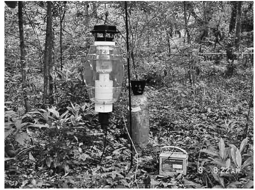
Fig. 1. The MM-X experimental trap is a battery-powered counterflow geometry trap for collecting hematophagous insects. An exhaust plume exits the narrow tube protruding below the larger white intake tube. Mosquitoes are safely held away from the uptake airflow, resulting in low mortality while maintaining mosquitoes in good physical condition.

The CDC Wilton trap (model 1912; John W. Hock Company, Gainesville, FL) is a downdraft suction trap designed to capture Ae. aegypti and Culex quinquefasciatus Say (Wilton and Kloter 1985). It is believed to mimic tree holes and thought to be attractive to gravid adult females seeking an oviposition or resting site. It consists of a single 14.5 cm long × 8.5 cm diameter flat black cylinder that serves as a visual attractant and a 4-blade fan driven by a 6 V direct current (DC) motor powered by a 6 V rechargeable battery. Mosquitoes are collected in a removable white plastic cup with a stainless steel screen bottom set inside the cylinder between the trap opening and the fan. The Wilton trap was set 90 cm (3 ft) above ground and was supplemented with compressed CO 2 (500 ml/min) to collect host-seeking adult mosquitoes in addition to gravid females. This small trap was lightweight (less than 2 kg) and easy to set. The constant high velocity of air flow resulted in collections of mosquitoes that were difficult to identify.