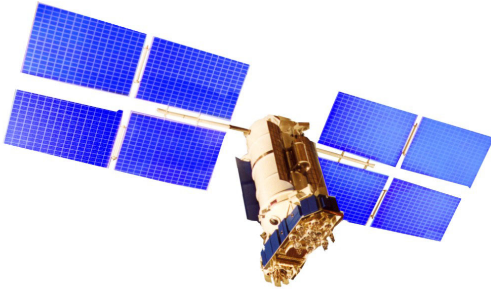
Figure 2. GLONASS-M satellite overall view.

The GLONASS-M satellite can be launched in tandem (three satellites simultaneously from the Baykonour Cosmodrome using a Proton-M launcher with a Breeze-M booster) and in a single launch (from the Plesetsk Cosmodrome using a Soyuz-2 launcher with a Fregat booster).