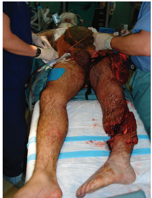
Fig. 2. Photograph of patient with multiple injuries and a tourniquet used on the thigh. The patient had a proximal femur fracture with femoral artery and vein transection and a near-complete below-knee amputation. The only left leg structures partially intact were in the deep posterior compartment. Other potentially lethal injuries required massive transfusion, emergency department thoracotomy and aortic cross clamping, open manual cardiac massage, three cardiac electroconversions, emergency laparotomy and ligation of the common iliac, femoral arteries and veins as hemorrhage control measures, and an intensive care unit respite to correct coagulopathy before the tourniquet could be attended and amputation done for the ischemic limb sequelae. This patient had a transfemoral amputation performed after 14 hours of tourniquet application. The patient survived.

428 tourniquet uses (97%). Tourniquets distal to the most proximal limb wound numbered five on four limbs in four patients; two of these four patients died. A tourniquet was placed atop the wound in another patient; this patient had the