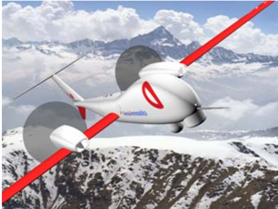
Figure 5: Molynx Male UAV

Potential evolution of the system to carry out commercial activities is envisaged, even if a maturity of the market, including the proper evolution of the regulations related to the use of the UAV in non segregated areas is required.