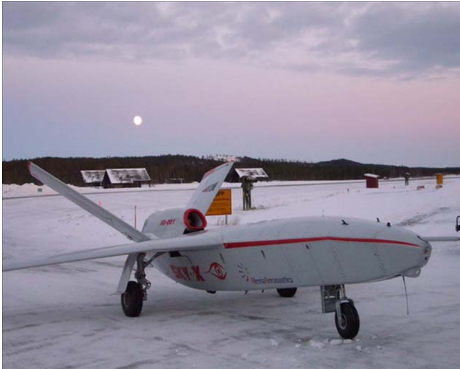
Figure 3: Sky-X UAV demonstrator during flight test in the Vidsele test range (Sweden)

The following technologies will be demonstrated in the Neuron: