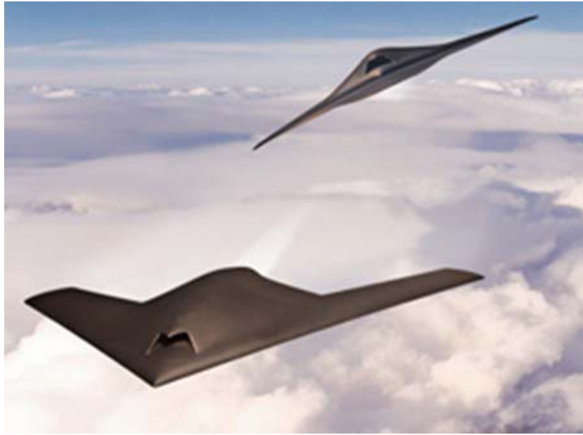
Figure 4: Neuron UCAV demonstrator

The first UAV system that will benefit of the autonomous technologies will be the Molynx. It is an Alenia Aeronautica initiative aimed at providing an advanced MALE UAV product for a large spectrum of applications, such as: