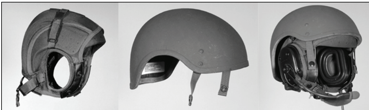
Figure 1. From left to right: CVC liner; CVC ballistic shell, assembled helmet with embedded headset.

As stated earlier, the MK1697/G liner comes in three sizes: small, medium, and large. The ECVCH has a universal liner that is intended to be adjustable to fit all heads through the use of hook and loop straps on the sides and nape of the liner. The ballistic shells used for both helmets come in two sizes: small/medium and large. Two samples of the MK1697/G helmet were received for the evaluation, one sized small and one sized large. Five samples of the ECVCH were received for the evaluation. The determination of the appropriate size of the MK1697/G helmet for each participant was made, based on the participant's reported comfort while wearing a particular size. The ECVCH was adjusted on each participant's head for comfort. For both helmet models, the chin strap was secured and the helmet rested firmly on the participant's head.