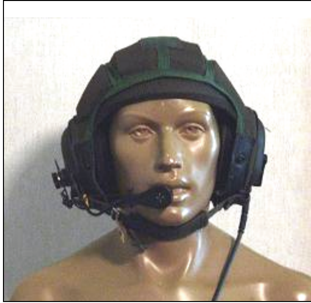
Figure 2. KEMAR with CVC headset for frequency response measurements.