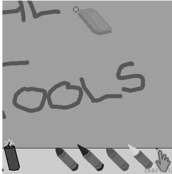
Figure 2: Some tools used in KidPad: An eraser, a bomb (for erasing an entire drawing), some crayons, and a hand (for moving objects).