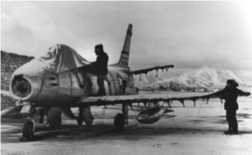
An Air Force ground crew “unwraps” a North American F-86 Sabre on a cold winter day in Korea; this F-86 will soon fly north hunting for Chinese MiG-15s.