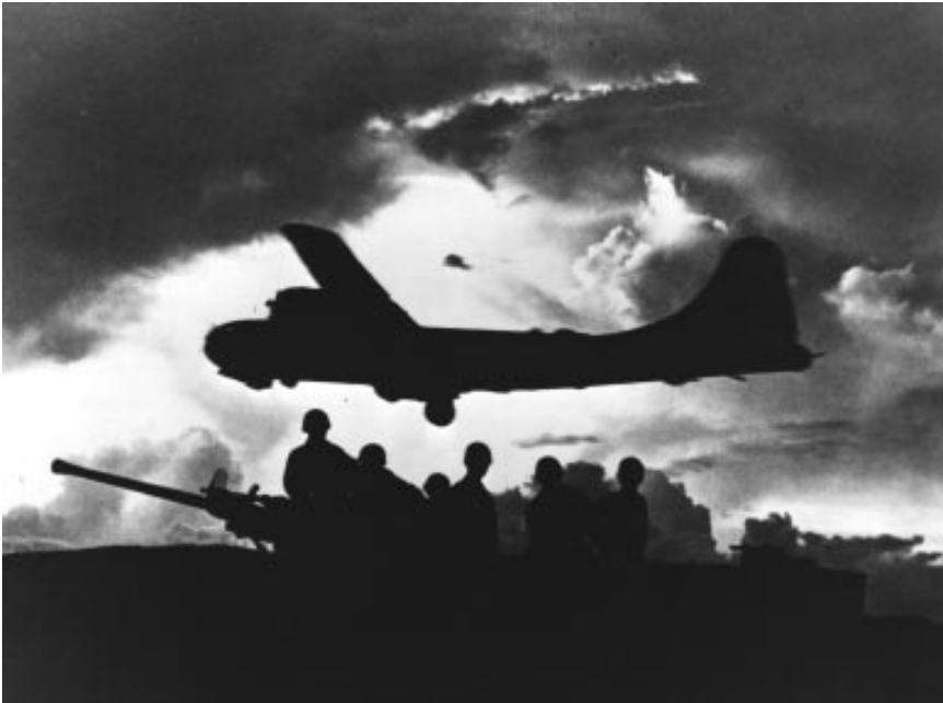
A Boeing B-29 Superfortress takes off from Japan to bomb a target in Korea.

istration would not let him use incendiaries against cities and instructed him to minimize civilian casualties, depriving the enemy of a propaganda issue. The use of fire bombs proved unnecessary that summer, for in mid-September after about one month of systematic bombardment, Stratemeyer announced that practically all the strategic industrial targets in the country had been destroyed by high explosives alone. Since American fighters had wiped out the North Korean air force and the enemy had few anti-aircraft guns, B-29 crews could concentrate on accurate bombing. The big problem was weather, for clouds often closed in over the B-29 bases during the course of a mission, and in such conditions, landing was the most dangerous part of the flight.