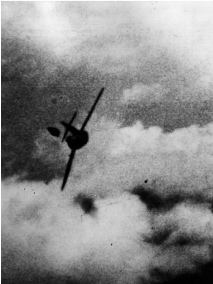
Pilot ejects from downed MiG. The victor in this combat was Edwin E. Aldrin, later one of the first astronauts to walk on the moon.

veillance during the Chinese buildup south of the Yalu River in October and November 1950. A fleet of aging B-29s destroyed almost every vestige of industry in North Korea, but armaments from nations whose factories could not be bombed satisfied North Korea's needs. Absolute control of the air did not ensure victory on the ground, for the enemy's transportation system survived sustained air attacks and provided the volume of supplies necessary for an essentially static war, marked after the spring of 1951 by only limited offensives. The emphasis should be placed, however, on the accomplishments of air power: supplying the ground forces; eliminating the threat of aerial attack on the movement and logistical