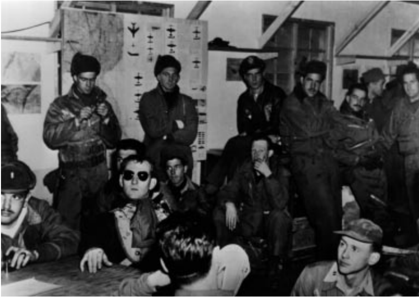
F-51 Mustang pilots await debriefing after attacking Chinese forces near Seoul, South Korea.

arm attacked a B-26 and a T-6 but failed to down either, and four MiG-15 jet fighters bearing Chinese markings darted across the Yalu and jumped four F-51s, all of which escaped. When night fell at Unsan, some 75 miles east of Sinuiju, Chinese infantry attacked both American and South Korean units, inflicting severe casualties. The Chinese were not merely reinforcing the defeated North Koreans but were taking over the war. Instead of some 17,000 troops, as MacArthur's staff believed, as many as 180,000 had already entered North Korea, traveling by night when American aerial reconnaissance could not detect them and remaining hidden during daylight.