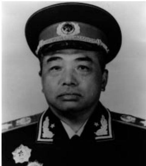
Marshal Peng Dehuai commanded Chinese forces during the Korean War.

After the first attacks by Chinese troops in late October and early November, quiet settled over the North Korean battlefields; the new enemy seemed to have vanished as suddenly as he appeared. After pausing two weeks to regroup, MacArthur on November 24 launched an offensive that he believed would drive the enemy across the Yalu and into China. He was confident that the United Nations Command could rout the Chinese, now estimated to number about 70,000, and the slightly larger remnant of the North Korean People’s Army. In fact, some 300,000 Chinese, along with the