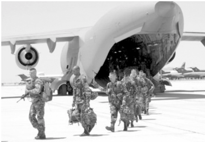
Soldiers prepare for ATEx02, Army Transformation Experiment, part of the Army's participation in Millennium Challenge 2002. MC02 was the largest joint peacetime exercise ever held.

In October 1999, Atlantic Command, which had been established in 1993 as a regional command with joint authority, was re-designated United States Joint Forces Command (USJFCOM). In addition to its other responsibilities, JFCOM was given the mission of joint training and transformation as outlined in the Department of Defense's Unified Command Plan. As the Army's trainer, TRADOC coordinated closely with JFCOM. In 1999, JFCOM absorbed the Joint Warfighting Center into its Joint Training Center at Suffolk, VA. In 2002 TRADOC participated in Millennium Challenge, the U.S. military's largest joint peacetime exercise to date, which was controlled by JFCOM. TRADOC had the Army lead for Millennium Challenge 02 and coordinated with JFCOM to provide management oversight for the overall