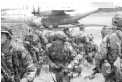
Soldiers arrive via a C-130 aircraft for training at the Joint Readiness Training Center at Fort Polk, LA

The NTC was a joint TRADOC-FORSCOM project. The major features of the training center were the employment of MILES for casualty assessment; a sophisticated data collection system for exercise control and data collection; a TRADOC Operations Group; a superbly trained opposing force (OPFOR); expert exercise observer-controllers; after action reviews of unit performance; and take home packages designed to aid units in correcting deficiencies while training at home station. The success of the NTC in training heavy mechanized forces led the Army to establish a similar facility for the training of light forces. The Joint Readiness Training Center (JRTC) opened, on a temporary basis, at Fort Chaffee in October 1987. Like the NTC, it featured a TRADOC Operations Group and an OPFOR. Unlike the NTC, the JRTC was completely a TRADOC project in its early days and until the light training center moved to a permanent home at Fort Polk in 1993. At that time the JRTC became a TRADOC-FORSCOM effort like the NTC. In 1988, the Army began to plan for a Combat Maneuver Training Center (CMTC) at