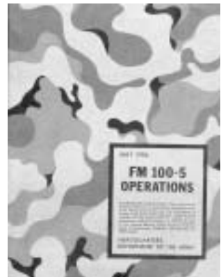
The 1993 edition of FM 100-5, Operations, reflected the new world situation in the Post-Cold War period and the focused on deployment from CONUS rather than a forward based Army.