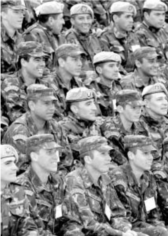
U.S., Chilean, and Argentine soldiers train together in South America. TRADOC relations with South and Central American armies has strengthened since the command's founding in 1973.