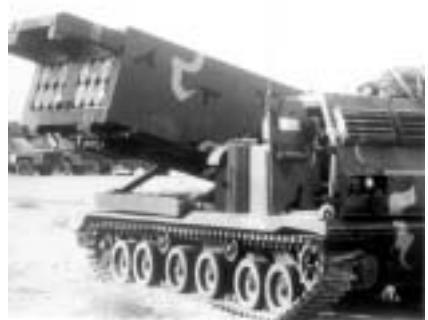
A significant development for TRADOC was the fielding of the air defense system known as the Patriot.

TRADOC took a “total systems” approach to weapons development, bringing trainers, logisticians, and personnel managers into the process early. The total systems methodology