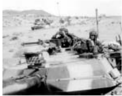
M1 Abrams equipped with the Multiple Integrated Laser Engagement System, always known as MILES, is shown here training at the National Training Center, Fort Irwin, CA

training in the field. One of these was known as SCOPES, for Squad Combat Operations Exercise Simulation. SCOPES was designed to eliminate the judgment of umpires that was highly subjective, and featured a 6-power telescope mounted on a rifle with numbers affixed to each individual soldier for the identification of casualties. A similar system for training tank crews called REALTRAIN had a 10-power scope. In the early-to-mid 1970s, TRADOC began developing a more sophisticated tactical engagement simulator for use in force-on-force field training exercises. That system, the Multiple Integrated Laser Engagement System, always known as MILES, revolutionized collective training in the Army. In 2003, the system—after several upgrades—continued to be the Army’s most innovative and effective training device.