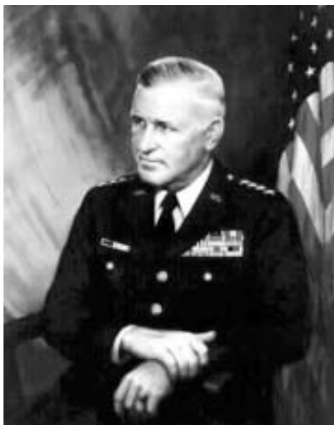
General Creighton Abrams, Chief of Staff of the Army, October 1972-September 1974, directed the STEADFAST initiative that created TRADOC.

The Department of the Army established TRADOC on 1 July 1973 at Fort Monroe, Virginia, as part of the major STEADFAST Reorganization of the Army in the United States, brought to completion that year. The STEADFAST initiatives, directed by General Creighton Abrams, Chief of Staff of the Army, attempted to solve difficult command and control problems in the Army establishment evident in the early 1970s. The span of control of TRADOC's predecessor, the Continental Army Command, or CONARC, reached through the headquarters of the numbered armies to the corps and divisions and included most of the major Army installations in the United States. Given such a wide control span, together with responsibilities for both the training and education establishment and for unit readiness, CONARC obligations were too broad for efficient focus..