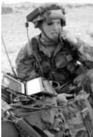
A radio telephone operator at Fort Lewis, WA, uses the dismounted Soldier System unit during an AWE in March 1997.

experiments” (AWE) to carry through a sequence of experiments and simulations to examine the emerging digitization concept. Bearing names such as Desert Hammer VI, Roving Sands, Prairie Warrior, Mobile Strike Force, Focused Dispatch, and Warrior Focus, these exercises and experiments—from platoon to theater levels—were variously directed by the TRADOC Battle Laboratories and the National Simulation Center at CAC.