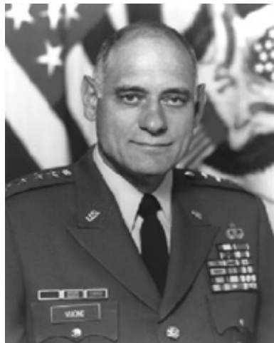
General Carl E. Vuono, Commanding General, 30 June 1986-11 June 1987

Efforts in force modernization concentrated on improved application of the Concept Based Requirements System and a new emphasis on a system of systems approach to equipment modernization. Leader development was