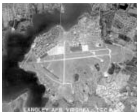
TRADOC's participation in joint Army/Air Force initiatives such as the ALFA, ACRA, and CLIC was, in part, because of the proximity of Langley Air Force Base, seen here in a 1985 aerial photo.

ALFA work was also incorporated into the NATO doctrine of battlefield air interdiction. TAC-TRADOC work resulted in a November 1984 agreement on joint procedures for offensive air support. Joint suppression of enemy air defenses (J-SEAD) was another significant project in cooperation with U.S. Readiness Command; a joint concept was published in April 1981. In December 1982, the three headquarters published the Joint Attack of the Second Echelon, or J-SAK, which delineated attack procedures by level of command for the identification and attack of the enemy follow-on echelons. The project lay at the heart of TAC contributions to the deep attack aspect of the Army's AirLand Battle doctrine published in August 1982. TAC-TRADOC projects expanded in the late 1970s to joint tactical training projects, tests, and