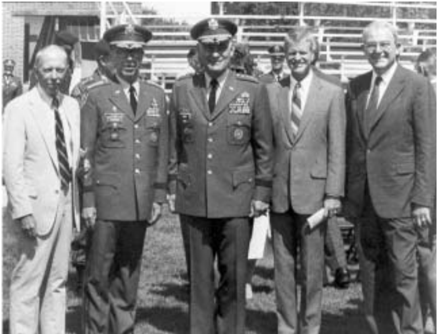
Five former TRADOC Commanders gather at Fort Monroe.

At the thirty-year mark, eleven commanders had served the U.S. Army Training and Doctrine Command. Each led the command from a perspective based on personal and professional experience, the evolving international situation, national priorities, and the defense fiscal environment. Each impressed upon the organization his own vision and style of management, within the framework of his commander's intent.