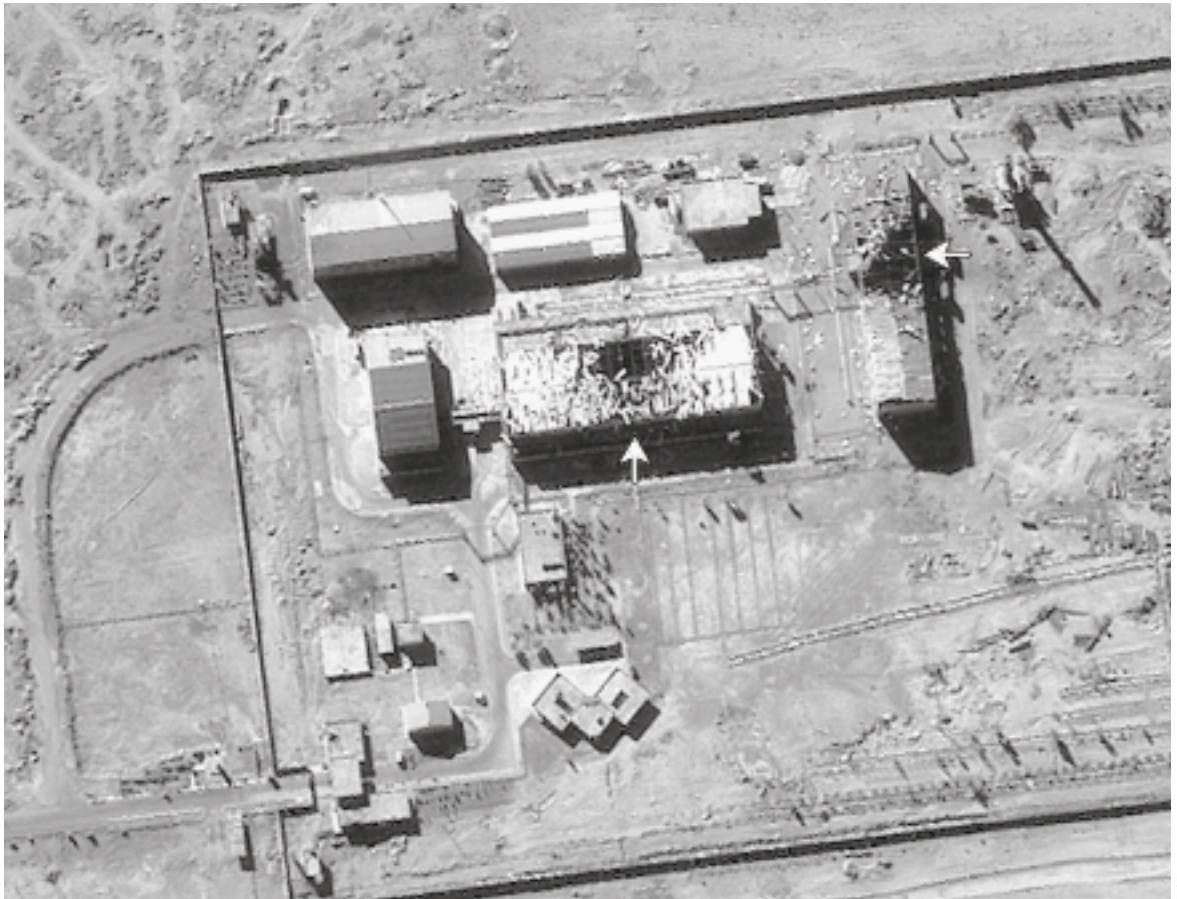
Bomb damage assessment, Desert Fox.

of wars fought. During the Cold War attrition-based simulations strongly influenced acquisition of lethal attrition-oriented systems. While continued reliance on a Cold War attrition-based paradigm is likely to perpetuate large military organizations, a more robust analytic construct could suggest ways to conduct warfare with smaller, more agile forces which are more suitable to implementing RMA concepts. Fundamental to such a paradigm shift is understanding the broader dynamics of warfare and the impact of emerging technologies and techniques.