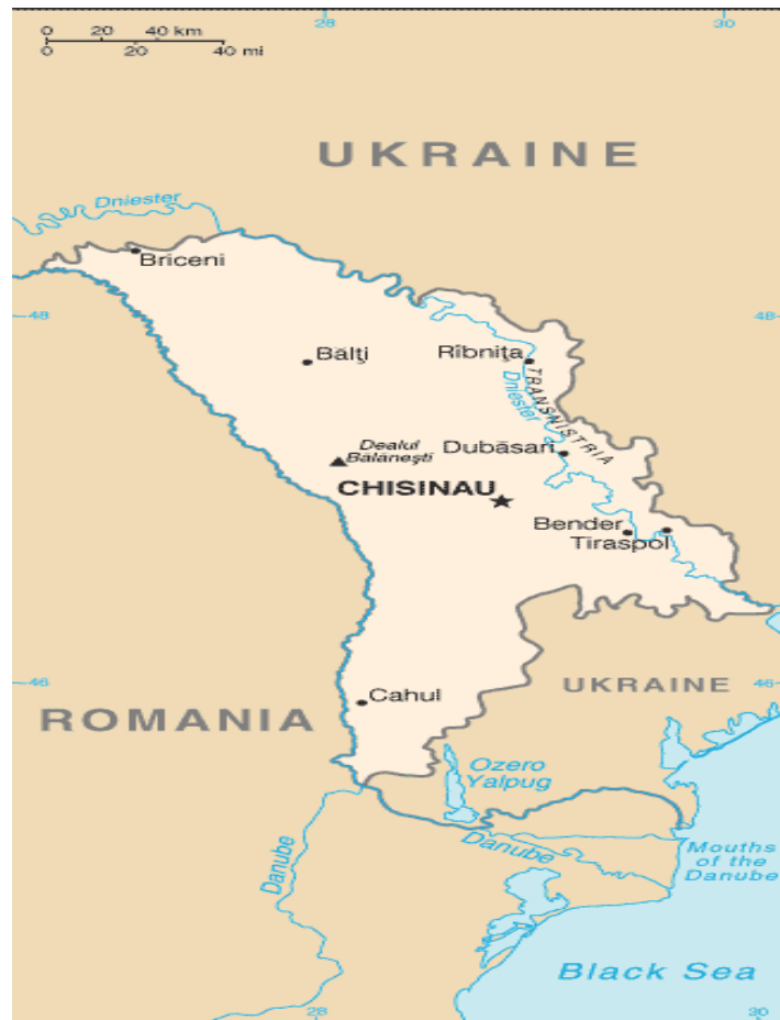
Figure 1. The Republic of Moldova 4

recognized by the international community, and after that, to compromise the contract and secede, which will bring the same consequences as previously discussed. The third option, federalism, is currently promoted by the international community and argued by both parties in the conflict and seems to be the optimal solution to this problem. The author argues that in the current situation, the federalization of Moldova will not diminish the conflict, but will create a situation of political stagnation, democratic drawback, and further dependency from Russia, factors that might provoke further escalation of the conflict. Thus, internal actors as well as the international community first have to direct their efforts toward the creation of the necessary conditions for federal agreements to last, and after that, only to pursue a policy of federalism. Otherwise, Moldovan federalism is doomed to failure from the very beginning.