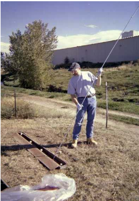
Figure 2. Evaluating longevity of the zero-valent iron PRB at Lowry AFB.

The longevity assessment looked at groundwater data, iron cores, deposits from silt traps, accelerated long-term column tests, and geochemical modeling from two sites where PRBs were installed more than 5 years ago: former Naval Air Station (NAS) Moffett Field and former Lowry Air Force Base (AFB) (see Figure 2). Both PRBs are currently performing as designed, removing chlorinated solvents from groundwater to below detection limits, and are predicted to perform acceptably for at least 30 years. However, the longevity evaluation observed that the reactivity of the iron deteriorates progressively with exposure to groundwater.