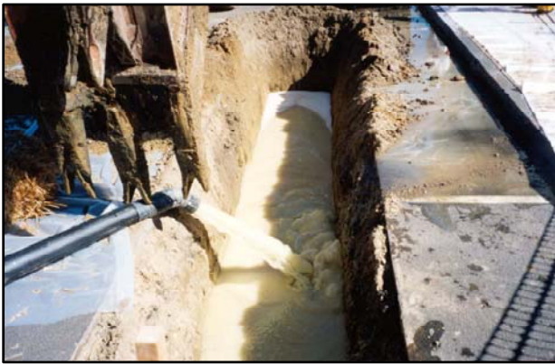
Figure 4. Biodegradable slurry (guar gum) is added to a trench to shore up the excavation until the PRB medium is installed.

One important advance in the use of backhoe trenching is the use of a biodegradable slurry (or bioslurry) to shore up the excavation (see example in Figure 4). Bioslurry is a highly viscous solution of guar gum that keeps the excavation open and eliminates the need for sheet piling or trench boxes. The PRB reactive material, usually iron, is tremied into the excavation and allowed to settle through the slurry. Caution must be exercised to ensure that the guar gum slurry does not degrade before the installation of the reactive medium is complete. A biocide typically is added to the bioslurry in order to delay the degradation of the slurry, but the introduction of biocides below ground may cause regulatory concern at some sites. Following installation of the iron, an enzyme breaker is added to the trench to hasten degradation of the guar gum and to establish flow through the PRB. Bioslurry was used to install iron in a 65-foot-deep PRB trench at Lake City Army Ammunitions Plant, MO.