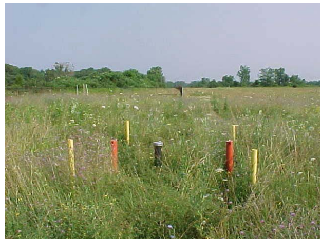
Figure 1. Monitoring wells for evaluating the reactive and hydraulic performance of a PRB at Seneca Army Depot.

Thorough compliance and performance monitoring also is critical to successful implementation of PRBs. Monitoring wells are typically located on all sides of the PRB, within the treatment medium, and at numerous upgradient and downgradient locations (see Figure 1). Normal compliance monitoring parameters include the target contaminants, degradation products, and general water quality parameters. Typical performance monitoring parameters include hydrologic parameters, Eh, dissolved oxygen, and geochemical parameters (e.g., calcium, magnesium, and alkalinity). These parameters are used to monitor for potential loss of reactivity, decrease in permeability, decrease in residence time in the treatment zone, short-circuiting, and leakage.