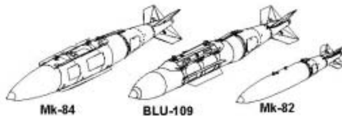
Figure 1 JDAM 84, JDAM 109, JDAM 82

During Operation ALLIED FORCE, the B-2 employed the tail sections (guidance kits) added to existing inventories of MK-84 and BLU-109 2,000 pound bombs, providing a highly accurate weapon delivery in any “flyable” weather. The MK-84 is a general-purpose weapon while the BLU-109 is a penetrating weapon. The tail sections also fit the MK-83 and BLU-110 1,000 pound bombs. Growth of the JDAM family led to the development of a tail section for the MK-82 500-pound weapon. (Figure 1)