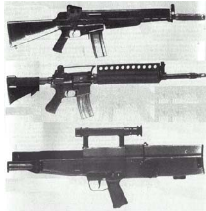
Figure 2-2 Prototype ACRs

Concurrently and as a result of NATO munitions standardization, requirements developed by the Marine Corps and the United States Army Infantry Center, Ft Benning, GA (USAIC) led to the development of the M16A2. M16A2 improvements included a redesigned barrel to support firing a heavier projectile, improved sights and integral provisions for left-handed firers. Due to munitions and weapon enhancements, the rifle's range increased to 800 meters from 300 meters.