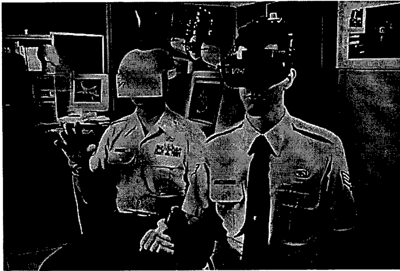
Virtual reality research.