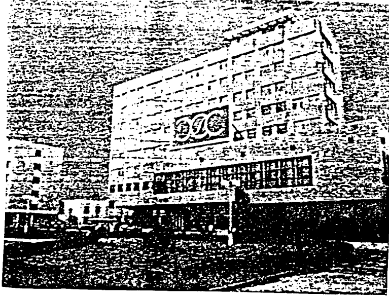
Fig. 1. Exterior view of Xi'an Satellite Control Center

for automatic adjustment of multiple (six) satellites