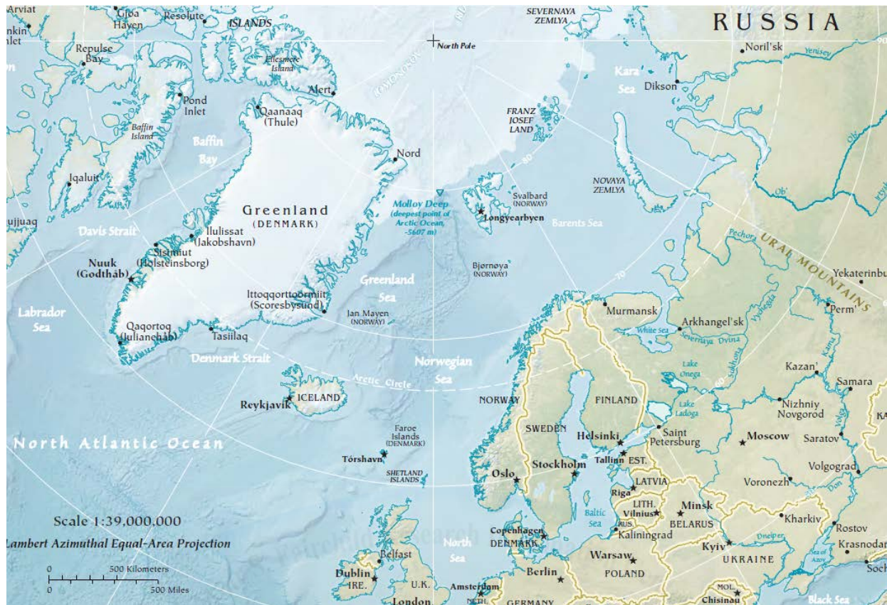
Map of the European Arctic (Adapted from www.CIA.gov ; “Arctic Region” 31 )

The European Arctic extends all the way to the North Pole, key terrain is the Svalbard Archipelago and Iceland, framed by two naval warfare chokepoints the Greenland-Iceland-UK gap (GIUK gap) and the Svalbard-Murmansk gap, and the landmass of Norway and Greenland. Iceland is key terrain for military operations in the European Arctic, due to the geographical location in-between Greenland and the UK, enabling air/sea surveillance and control of the GIUK gap by deployed forces. 32 The GIUK gap was a major naval warfare chokepoint during the Cold war, as NATO navy forces and aircraft could block Soviet access to the Atlantic Ocean. 33 The Svalbard-Murmansk gap is the opening in which the Russian Northern Fleet has to pass through for operations in the European Arctic. In addition, it is the only opening to the European Arctic for the Russian Navy in the event of U.S./NATO-Russia conflict, as the Baltic fleet is locked by the Danish Straits and the Black sea fleet is locked by the Turkish Straits. 34