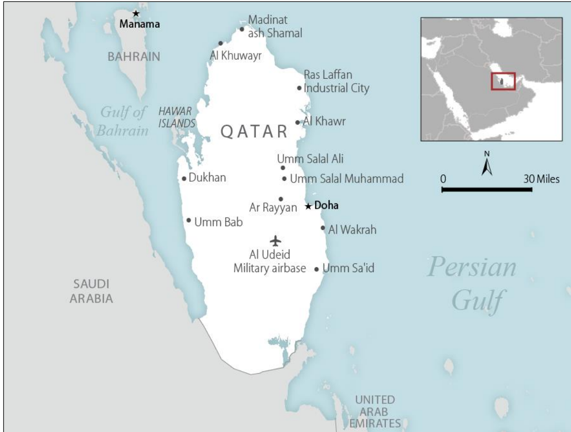
Figure I. Qatar At-A-Glance